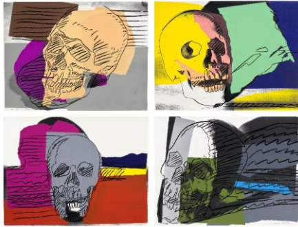
Andy Warhol Skulls (F. & S. 157-160), 1976 Estimate: £60,000 - 80,000

celebrity status while confronting the realities of poaching. Additional Warhol highlights include Skulls , and Queen Margrethe II of Denmark .