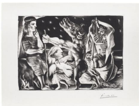
Pablo Picasso Minotaure aveugle guidé par une fillette dans la nuit , from La Suite Vollard , 1934 Estimate: £60,000 - 80,000

Pablo Picasso is represented by standout works including Minotaure aveugle guidé par Marie-Thérèse au pigeon dans une nuit étoilée , a deeply personal and politically charged etching from La Suite Vollard , depicting the artist as a blind Minotaur led by his muse through darkness, symbolising both his complex relationship with Marie-Thérèse and the looming turmoil of 1930s Europe.