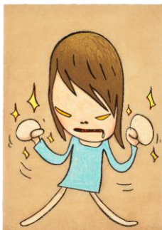
Yoshitomo Nara Fight , 2013 Estimate: £25,000 – 35,000