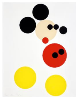
Damien Hirst Mickey , 2014 Estimate: £25,000 - 35,000