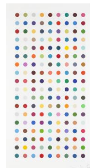
Damien Hirst Methamphetamine , 2004 Estimate: £30,000 - 50,000