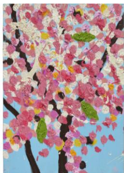
Damien Hirst Rejoicing Blossom , from Paper Blossoms , 2021 Estimate: £40,000 - 60,000

Also on offer is Exaltation , a monumental tapestry from the artist's Enter the Infinite (The Visions) series, transforming the chaotic energy of his Spin Paintings into a vibrant, symmetrical, and kaleidoscopic design. Representing Hirst's signature Spot Painting style is Mickey , a reinterpretation of the iconic Disney character into simple coloured circles that balance playful abstraction with instant recognisability.