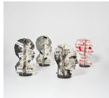
William Kentridge That Which I do Not Remember, from Triumphs and Laments , 2017 Estimate: £15,000 – 20,000