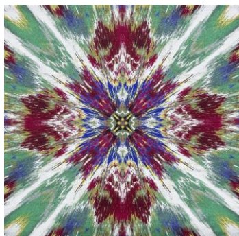
Damien Hirst Exaltation , from Enter the Infinite (The Visions) , 2016 Estimate: £30,000 - 50,000