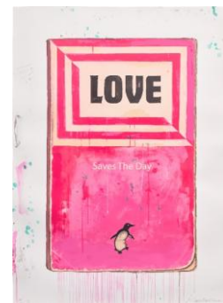
Harland Miller Love Saves the Day , 2014 Estimate: £30,000 - 50,000