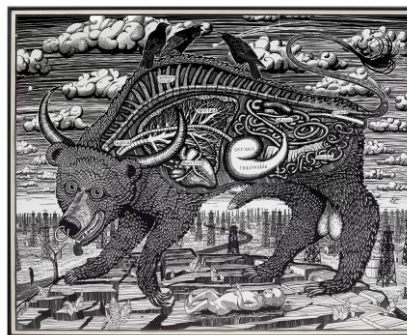
Grayson Perry Animal Spirit , 2016 Estimate: £15,000 – 20,000