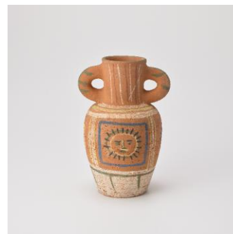
Pablo Picasso Vase au décor pastel (Vase with Pastel Decoration) (A.R. 190), 1953 Estimate: £10,000 – 15,000

Highlights by Andy Warhol include African Elephant from his celebrated Endangered Species series. The present work transforms the majestic animal, using vibrant colours to spotlight both its grandeur and its vulnerability. Blending pop culture with environmental urgency, the work underscores Warhol's ability to elevate wildlife to