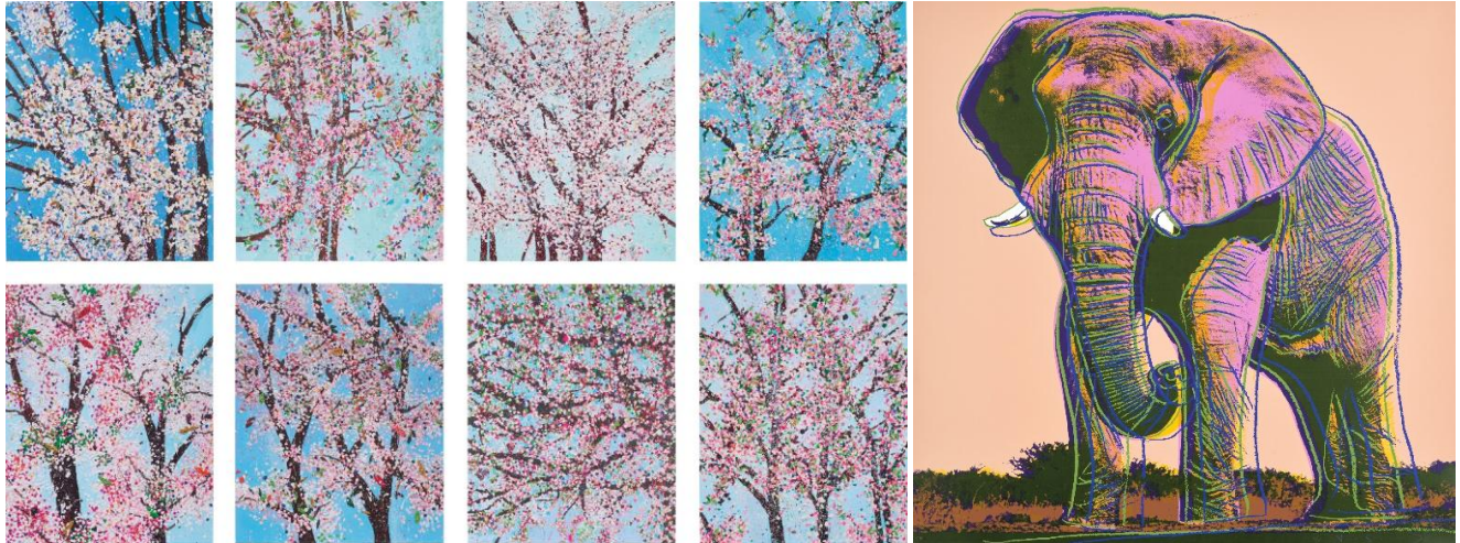
Damien Hirst , The Virtues , 2021, Estimate: £60,000 - 80,000, Damien Hirst Auction, and, Andy Warhol , African Elephant , from Endangered Species , 1983, Estimate: £60,000 - 80,000, Evening & Day Editions Auction

LONDON – 22 MAY 2025 – Phillips presents highlights from its upcoming Editions auctions in London this June, beginning on 5 June with a standalone live sale dedicated to Damien Hirst , one of the most influential and recognisable artists of the present day. The auction spans key series from across Hirst's career, representing editions and unique works on paper, at a range of price points. It will be followed by the Evening & Day Editions auctions on 5 and 6 June, featuring a curated selection of prints and multiples by leading modern and contemporary artists, including Pablo Picasso , Francis Bacon , Banksy , Andy Warhol and William Kentridge , alongside contemporary voices such as Yoshitomo Nara , Grayson Perry and Harland Miller . The public exhibition will be on view at Phillips' Berkeley Square galleries from 30 May to 5 June.