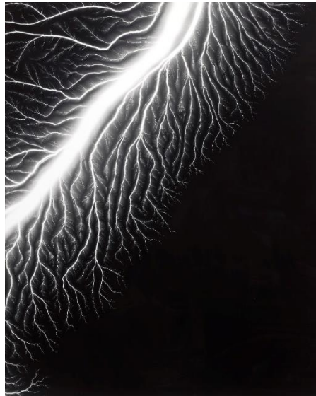
Hiroshi Sugimoto Lightning Fields 128, 2009 Estimate $40,000 - 60,000