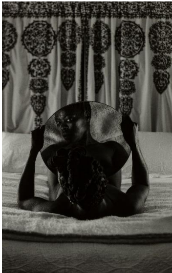
Zanele Muholi Bona, Charlottesville (9781), from Somnyama Ngonyama, 2015 Estimate $20,000 - 30,000

Featuring Works by the Most Prominent Names in Contemporary Photography, Including Hiroshi Sugimoto, Hank Willis Thomas, Zanele Muholi, Lee Friedlander, and Stephen Shore, Among Others