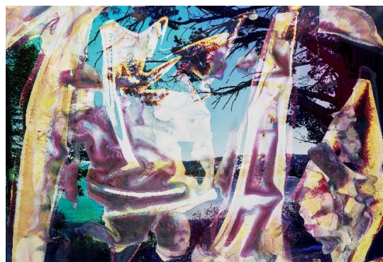
Matthew Brandt Big Bear, CA A2 , 2012 Estimate: $8,000 - 12,000