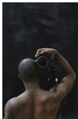
Paul Mpagi Sepuya Darkroom Mirror Study, or Aperture (0X5A3449) , 2017 Estimate: $7,000 - 9,000