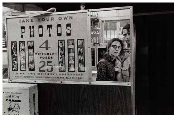
Lee Friedlander New York City , 1966 Estimate: $4,000 - 6,000