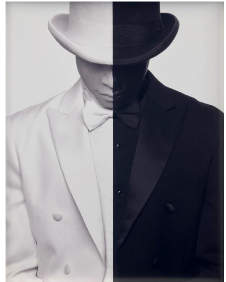
Hank Willis Thomas Baron of the Crossroads, 2012 Estimate $25,000 - 35,000