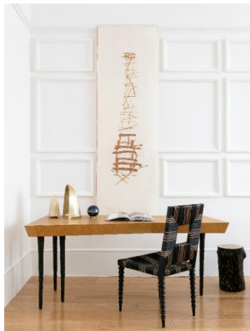
Arcane Desk and Cottage Chair by Pinto