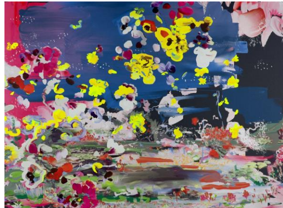
Petra Cortright, BABES4FREE , 2013