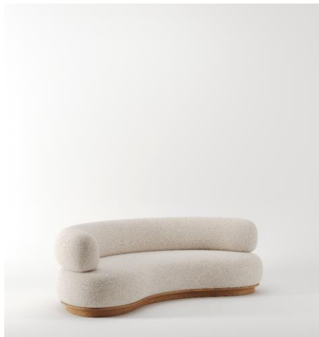
Odalisque Sofa by CSLB Studio