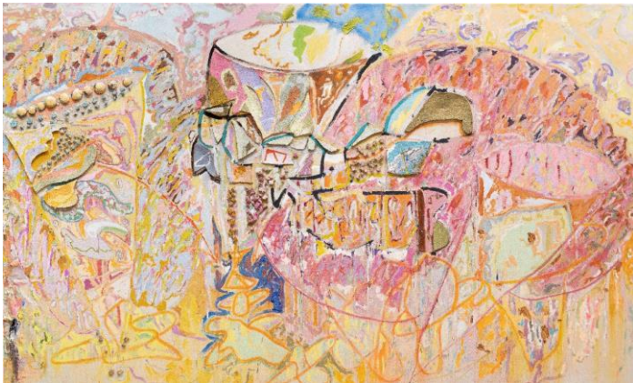
Larry Poons, Old Dan Tucker , 2002