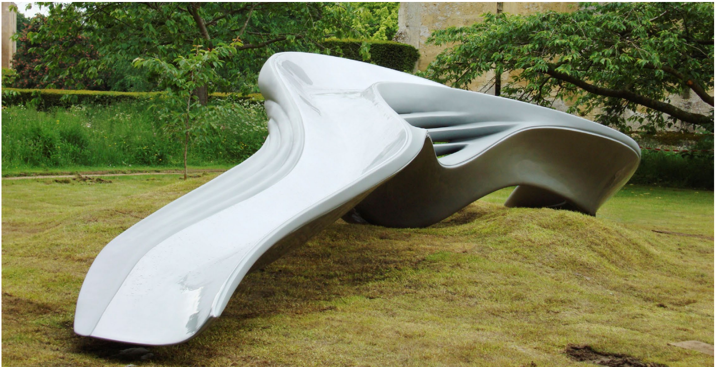
Zaha Hadid, Z-stream , 2008, sold for $127,000