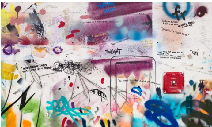
Lee Quiñones Tablet 19, 2005