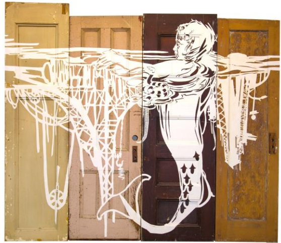
Caledonia Curry / SWOON, Tara and the Sea, 2021