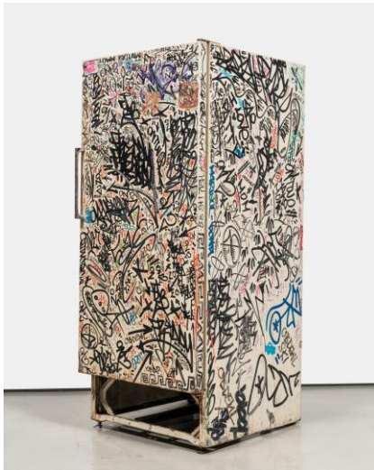
Jean-Michel Basquiat collaboration with Keith Haring, FUTURA, et al. Untitled (Fun Fridge) , 1981-1985