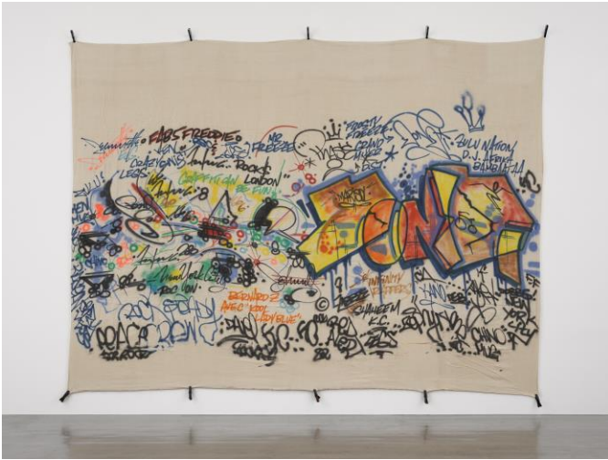
FUTURA 2000 Untitled, 1982