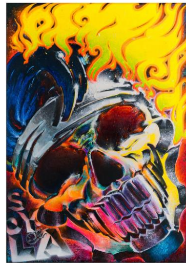
Chaz Bojórquez No More Pompadours , 1996