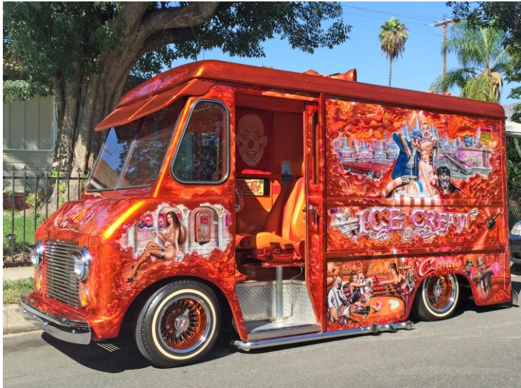
Mister Cartoon Ice Cream Truck , 1995

Over 150 Groundbreaking Works of Art from 1970s to the Present Day on Exhibition at 432 Park Avenue, Opening 13 January