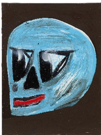
Eddie Martinez Alien, 2009 Estimate £12,000 - 18,000