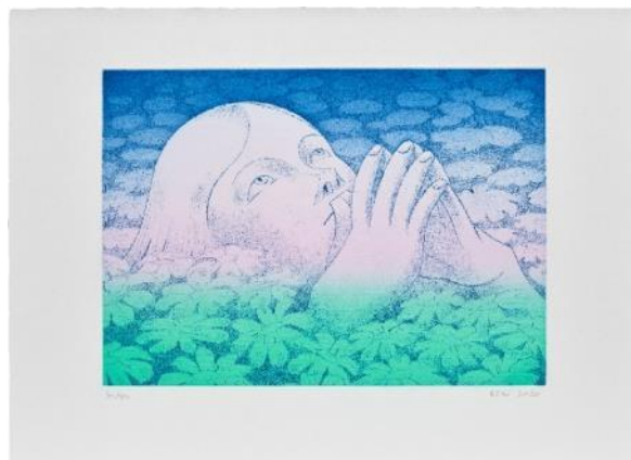
Robin F. Williams Earth Prayer, 2020 Estimate £2,000 - 3,000