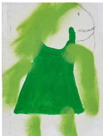
Robert Nava Green Dress, 2015 Estimate £10,000 - 15,000