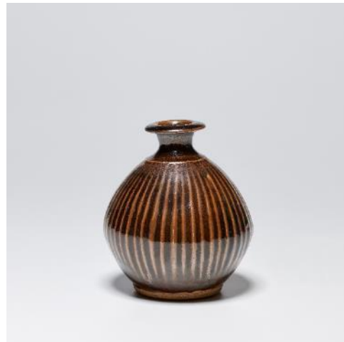
Bernard Leach Vase, circa 1965 Estimate £1,000 - 2,000