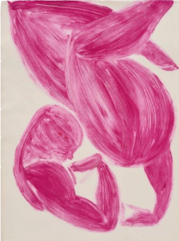
Tunji Adeniyi-Jones Dancing Figure VII , 2018 Estimate: £5,000 - 7,000

Online-Only Auction Now Online Until 22 July