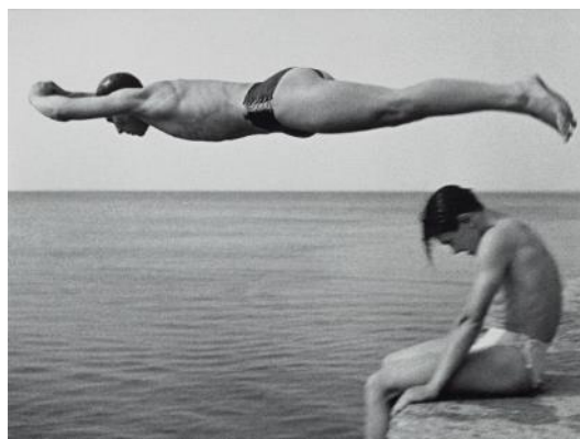
Nino Migliori Il Tuffatore, executed 1951, printed later. Estimate £5,000 - 7,000