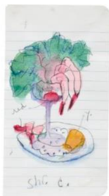
Claes Oldenburg Two works: (i) Millefeuille with Strawberries, Malmö, 1989 (ii) Shrimp Cocktail, New Haven/Connecticut, 1991 Estimate £2,500 - 3,500