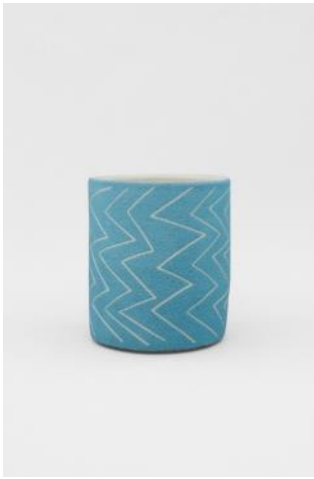
Shio Kusaka Zig zag 6, 2013 Estimate £4,000 - 6,000