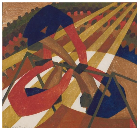
Lill Tschudi In the Circus (C. LT 23), 1932 Estimate: £2,000-3,000