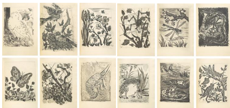
Pablo Picasso Eaux-fortes originale pour des textes de Buffon (Histoire naturelle) [Original Etchings for Texts by Buffon (Natural History)] (Bl. 328-358, Ba. 575-605, C. 37), 1936/42 Estimate: £25,000-35,000