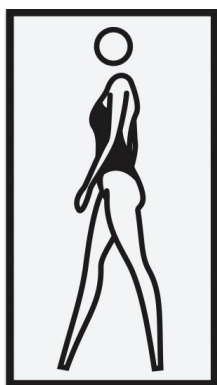
Julian Opie Monique Walking , 2004 Estimate: £25,000-35,000