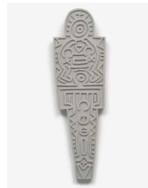
Keith Haring Totem (Concrete) , 1989 Estimate: £60,000-80,000

Having first experienced painting en plein air in 1949 at the Skowhegan School of Painting & Sculpture, Alex Katz returned to his outdoor studies in the 1960s when he began painting flowers during summer residences in Maine.