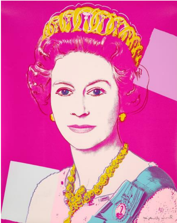
Andy Warhol Queen Elizabeth II of the United Kingdom, from Reigning Queens (F. & S. 336), 1985 Estimate: £100,000-150,000

Sales on 14 & 15 June to be Led by Andy Warhol's Queen Elizabeth II