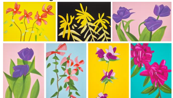
Alex Katz Flowers , 2021 Estimate: £70,000-90,000

As shown in the present work, Flowers , which will be offered in the Evening Sale this June, Katz' floral subjects are depicted in tightly cropped compositions. Clever splashes of colour indicate lush petals and broad, criss-crossing strokes imply leaves and stems, all overlaid on lively backgrounds of flat colour. Blending abstraction and representation, Katz's studies of blooms are intimate, yet expansive.