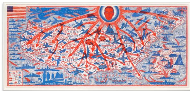
Grayson Perry The American Dream , 2020 Estimate: £40,000-60,000

Contemporary highlights of the Evening & Day Editions auctions include works from Julian Opie, Damien Hirst, David Hockney, and Grayson Perry. Shown here is The American Dream , printed by Perry in 2020. Made in response to the artist's travels in the U.S., during filming for his Channel 4 series 'Grayson Perry's Big American Road Trip', The American Dream captures a world of conflict rooted in social media.