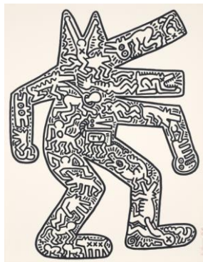
Keith Haring Dog (L. 48-49) , 1986-87 Estimate: £40,000-60,000

Further Pop Art highlights include a selection of Keith Haring works amongst which are Dog and Totem . Cast in 1989, the same year in which the artist was diagnosed with AIDS, the sarcophagus shape of Totem recognises man's mortality but hints at an embalmed, immortal afterlife. For Haring, who had been drawn to the imagery of ancient and primitive cultures throughout his career, the symbolic spiritualism of a totemic object made it the perfect form for his own idiosyncratic visual lexicon of signs and symbols. Within the confines of the concrete sarcophagus outlines, Haring's energetic and busy figures are pushing the boundaries in which they've been encased. Reflective of Haring's own history, challenging societal norms, Totem captures the vitality of life but reminds us of its impermanence.