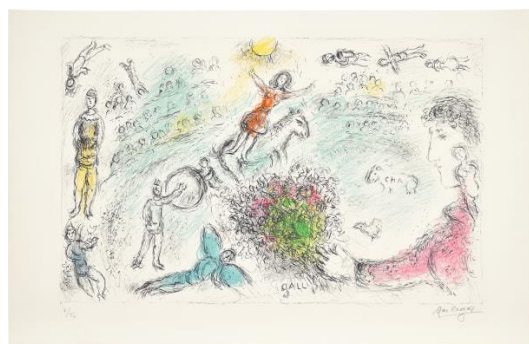
Marc Chagall L'Âme du Cirque (Spirit of the Circus) (M. 982), 1980 Estimate: £15,000-20,000