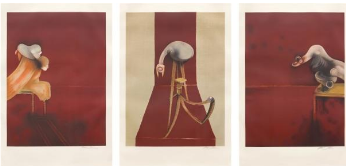
Francis Bacon Deuxième version du triptyque 1944 (after, Second Version of the Triptych , 1944) (S. 24, T. 25), 1989 Estimate: £35,000-45,000

A highlight of the Evening Sale, Francis Bacon's Deuxième version du triptyque is a later reworking of his iconic triptych titled Three Studies for Figures at the Base of a Crucifixion , which was completed 44 years earlier. Set before a deep scarlet backdrop, three distorted figures – part man, part beast – roar with monstrous rage. In this later work, where Bacon has chosen a blood-red void and given the figures more space to breathe, the palpable angst crawling against a setting of isolation presents the torment that is so archetypal to Bacon's oeuvre.