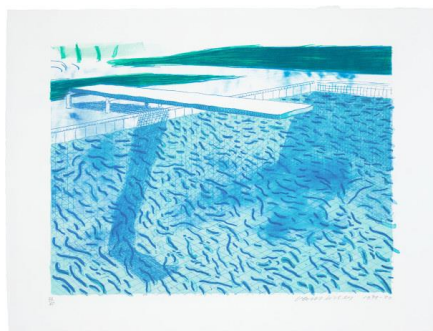
David Hockney Lithograph of Water Made of Thick and Thin Lines and Two Light Blue Washes (T.G. 250, M.C.A.T 207), 1978-80 Estimate £40,000 - 60,000