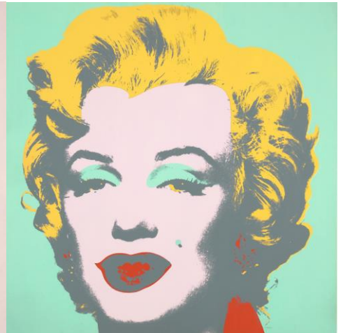
Andy Warhol Marilyn (F. & S. 23) , 1967 Estimate £100,000 – 150,000

LONDON – 10 JANUARY 2021 – Phillips is pleased to announce highlights ahead of the Evening & Day Editions auctions on 19 and 20 January. Led by a trio of iconic portraits: Banksy's Kate Moss (Purple/Orange) from 2005, and two Warhol Marilyn screenprints, the sale will also include Francis Bacon's Miroir de la tauromachie which comes to auction this month alongside the launch of a solo exhibition for the artist at the Royal Academy in London. Further highlights include a Modern group featuring Henri Matisse and Pablo Picasso, Pop Art from Andy Warhol and Roy Lichtenstein, and Contemporary editions from Miles Aldridge, Banksy, Damien Hirst, and David Hockney. The Evening sale on 19 January at 6pm will be followed by the Day sale on 20 January at 12pm. The exhibition is now live online on Phillips.com and the exhibition will be on view to the public in Phillips' galleries on Berkeley Square from 12 to 20 January.