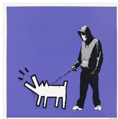
Banksy Choose Your Weapon (Dark Purple) , 2010 Estimate £100,000 - 150,000

In Banksy's Kate Moss (Purple/Orange) the artist pays homage to Andy Warhol's iconic portraits of Marilyn Monroe, of which two screenprints also feature in the sale. Bold, bright and blonde, Moss flaunts Monroe's most iconic attributes – her signature curls, flirtatious eyelashes, boldly-defined lips, and prominent beauty-spot. As well as Monroe's superimposed features, the addition of flat, solid colour in contrasting tones of purple and orange acts to capture Warhol's vivid Pop aesthetic. Banksy uses the image of Kate Moss with the same intentions as his predecessor – the commodification of visual icons. Further works by the artist to feature in these auctions include Choose Your Weapon (Dark Purple) , Girl with Balloon , Love Is In The Air and Napalm .