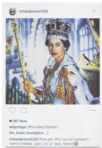
Richard Prince Queen Elizabeth II, from Instagram New Portraits, 2015 Estimate £1,000 - 1,500