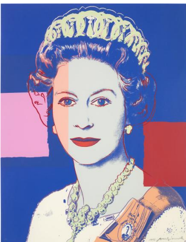
Andy Warhol Queen Elizabeth II of the United Kingdom, from Reigning Queens (F. & S. 337), 1985 Estimate £70,000 - 100,000