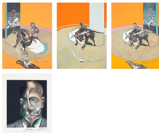
Francis Bacon Miroir de la tauromachie (Mirror of the Bullfight) (S. 29-30, T. 37), 1990 Estimate: £30,000 - 50,000

Francis Bacon's Miroir de la tauromachie is an excellent example of the artist's controversial, celebrated depictions of bullfights. Bacon's bullfights are composed within circular bull rings and often, as with the present work, contain a concave mirror in which bullfighter and bull confront each other and merge together in a swirl of movement. The present work is a complete set of four lithographs. A further nine works by Bacon will feature in the Evening & Day Editions auctions, including two self-portraits, a portrait of his great friend Lucian Freud, and a triptych.