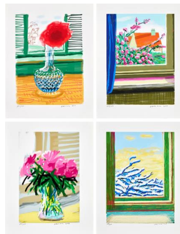
David Hockney My Window: No. 535 28th June 2009; No. 281 23rd July 2010; No. 610, 23rd December 2010; and No. 778, 17th April 2011, 2009-11/2019 Estimate £50,000 - 70,000

Included in the Evening & Day Editions auctions are a selection of iconic David Hockney editions showcasing a wide range of techniques. In Hockney's My window drawings the artist depicts the view through his window throughout the changing seasons. Also included in the selection of Hockney works are two of his lithographic swimming pools, a subject widely identified as the artist's most famous motif, embodying his fascination with post-war America and, in particular, the hedonism of California. Hockney's swimming pools also serve as a metaphorical springboard into an extended investigation that spanned decades of his career: the formal challenge of representing water.