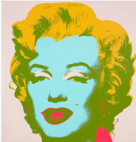
Andy Warhol Marilyn (F. & S. 28) , 1967 Estimate £70,000 – 90,000