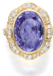
18 A Colored Sapphire, Diamond, a... Estimate $8,000 — 12,000