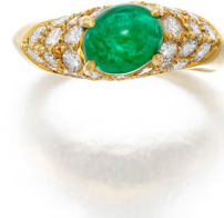
3 An Emerald, Diamond, and Gold... Estimate $1,000 — 2,000