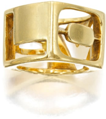
1 Donald Claflin for Tiff...

A Gold 'Tiffany Era' Ring Estimate $2,500 — 3,500