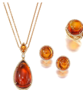
17 Margherita Burgener An Italian Suite of Citrine, Diam... Estimate $3,000 — 5,000