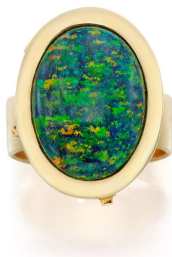
12 A Black Opal and Gold Ring Estimate $4,000 — 6,000