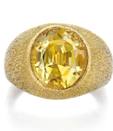
11 Schlumberger for Tiffa... A Yellow Sapphire and Gold Ring Estimate $8,000 — 12,000