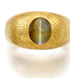
14 Schlumberger for Tiffa... A Cat's Eye Chrysoberyl and Gol... Estimate $4,000 — 6,000