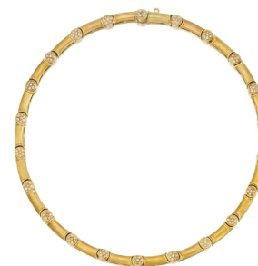
19 A Diamond and Gold Necklace Estimate $2,600 — 3,500