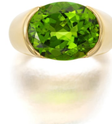
9 Tiffany & Co. A Peridot and Gold Ring Estimate $3,000 — 5,000