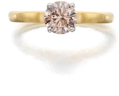
5 A Fancy Brown Diamond, Platin... Estimate $2,000 — 4,000