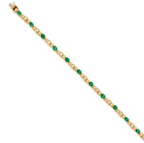
4 An Italian Emerald, Diamond, a... Estimate $5,000 — 7,000