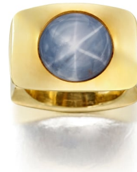
8 A Star Sapphire and Gold Ring Estimate $1,000 — 2,000