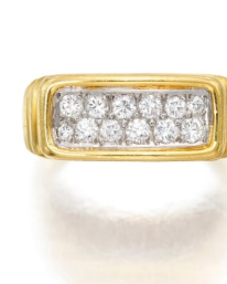
15 A French Diamond and Gold Ring Estimate $800 — 1,200