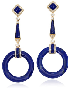
2 A Pair of Lapis Lazuli, Diamond, ... Estimate $1,000 — 2,000

A Gold 'Tiffany Era' Ring Estimate $2,500 — 3,500