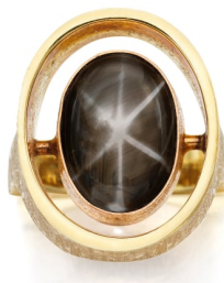
13 Whitt for Georg Jensen A Black Star Sapphire and Gold ... Estimate $1,000 — 2,000