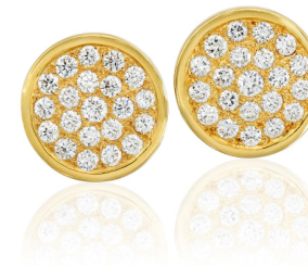
20 A Pair of Diamond and Gold Ear... Estimate $4,000 — 6,000