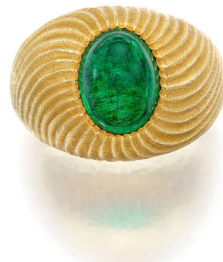
7 Schlumberger for Tiffa... An Emerald and Gold Ring Estimate $4,000 — 6,000