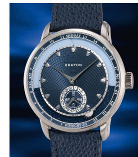
965 Krayon Krayon, 「Anywhere」型號CO... 估價 HK$700,000 — 1,400,000