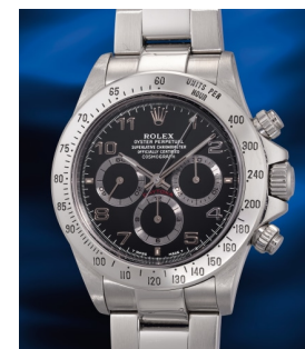
920 Rolex 勞力士，「Cosmograph Dayton... 估價 HK$800,000 — 1,600,000