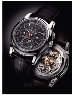
933 Patek Philippe 百達翡麗，型號5970P-013，可... 估價 HK$4,000,000 — 8,000,000