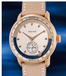
893 Krayon Krayon, 「Anywhere」型號C03... 估價 HK$700,000 — 1,400,000