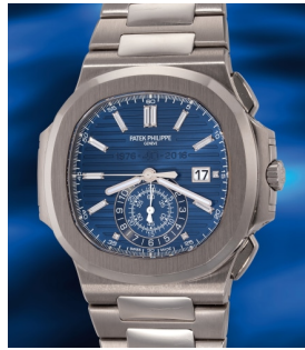
932 Patek Philippe 百達翡麗，「Nautilus 40th Ann...」 估價 HK$1,200,000 — 2,000,000