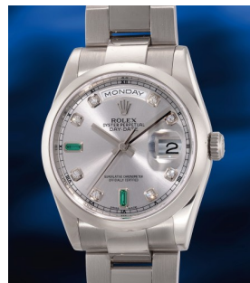
1052 Rolex 勞力士，「Day-Date」型號118... 估價 HK$140,000 — 240,000