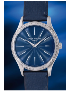
844 Patek Philippe 百達翡麗，「Calatrava Joailleri... 估價 HK$100,000 — 200,000