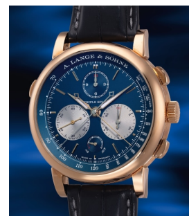
839 A. Lange & Söhne 朗格，「Triple Split」型號424.0... 估價 HK$650,000 — 1,000,000