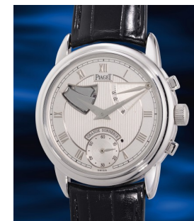
1000 Piaget 伯爵，「Gouverneur Grande So...