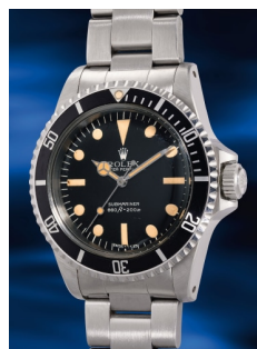
918 Rolex 勞力士，「Submariner」型號55... 估價 HK$65,000 — 100,000