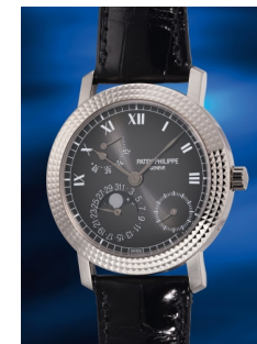
1055 Patek Philippe 百達翡麗，「Calatrava "Cortina... 估價 HK$120,000 — 240,000