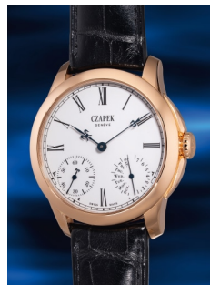
993 Czapek Czapek，「Quai des Bergues N...