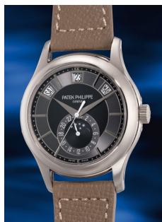
1056 Patek Philippe 百達翡麗，型號5205G-010，罕... 估價 HK$160,000 — 320,000