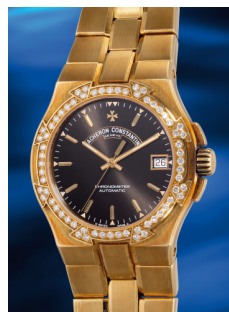
978 Vacheron Constantin 江詩丹頓，「Overseas」型號4... 估價 HK$100,000 — 200,000