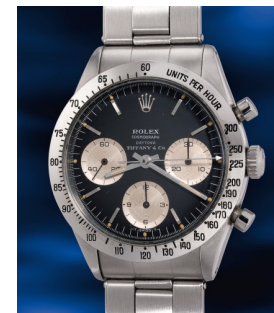
915 Rolex 勞力士，「Cosmograph Dayton... 估價 HK$630,000 — 1,300,000