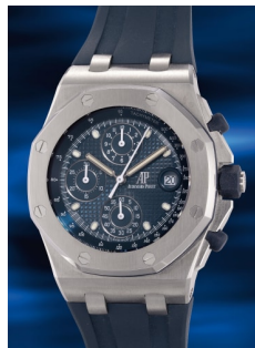
937 Audemars Piguet 愛彼，「Royal Oak Offshore Ch...」 估價 HK$120,000 — 240,000