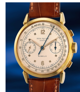
910 Patek Philippe 百達翡麗，「Anse a Ragno」...