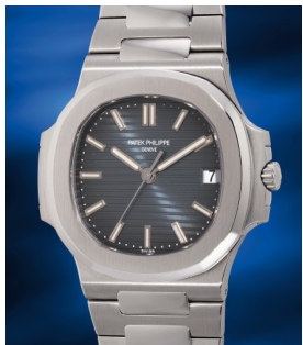
936 Patek Philippe 百達翡麗，「Nautilus」型號58... 估價 HK$320,000 — 640,000