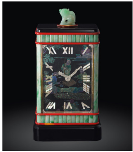
811 Cartier 卡地亞，獨一無二、重要，軟玉... 估價 HK$560,000 — 1,120,000

Hong Kong Auction / 23 May 2025 / 6:30pm HKT