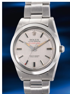
1042 Rolex 勞力士，「Milgauss」型號1019 ... 估價 HK$120,000 — 200,000