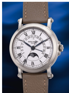
992 Patek Philippe 百達翡麗，型號5059G-000，精...