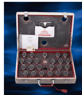
1044 Omega 歐米茄，「Speedmaster Missio... 估價 HK$450,000 — 750,000