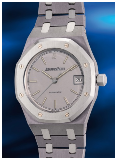
826 Audemars Piguet 愛彼，皇家橡樹 型號14790TT.O... 估價 HK$120,000 — 220,000