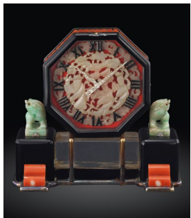
816 Van Cleef & Arpels 梵克雅寶，精美罕有，軟玉漆面... 估價 HK$160,000 — 320,000