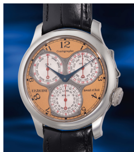
966 F.P. Journe F.P. Journe, 「Centigraphe Sou...」 估價 HK$480,000 — 960,000