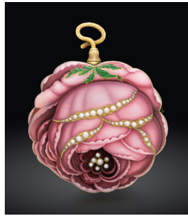
812 Swiss 瑞士製，十分精美罕有，黃金鑲... 估價 HK$320,000 — 640,000