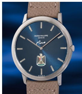
883 Patek Philippe 百達翡麗，「Calatrava」型號3... 估價 HK$80,000 — 160,000