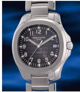
823 Patek Philippe 百達翡麗，「Aquanaut」型號 5... 估價 HK$400,000 — 720,000