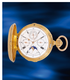
907 Louis Audemars & Co Louis Audemars & Co，精細，...