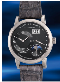
1002 A. Lange & Söhne 朗格，「Lange 1 Moon Phase」... 估價 HK$150,000 — 300,000