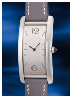
902 Cartier 卡地亞，「Tank Cintrée」型號...