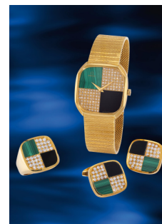
869 Omega 歐米茄, 型號BA 351.8656, 精... 估價 HK$64,000 — 128,000