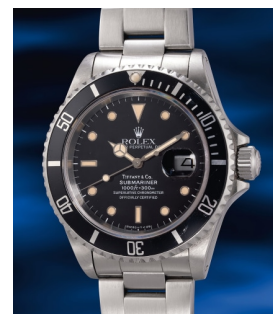
919 Rolex 勞力士，「Submariner」型號16... 估價 HK$120,000 — 240,000