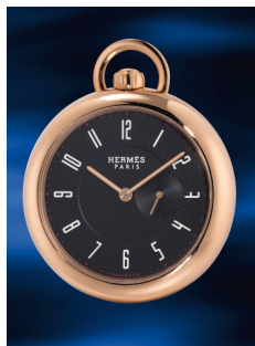
951 Hermès 愛馬仕，「Hermès In The Pocke... 估價 HK$40,000 — 80,000

Hong Kong Auction / 23 May 2025 / 6:30pm HKT