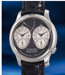
848 F.P. Journe F.P. Journe，「Chronomètre à R... 估價 HK$1,200,000 — 2,400,000