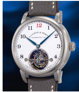
1003 A. Lange & Söhne 朗格，「1815 Tourbillon」型號 7... 估價 HK$640,000 — 1,280,000