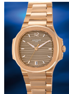
994 Patek Philippe 百達翡麗，「Nautilus」型號711...