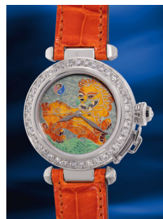
957 Cartier 卡地亞，「Collection Privée, Pa... 估價 HK$120,000 — 240,000