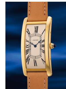
835 Cartier 卡地亞，「Tank Cintrée 100th A... 估價 HK$200,000 — 400,000