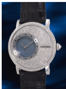
996 Cartier 卡地亞，「Ronde de Cartier ...