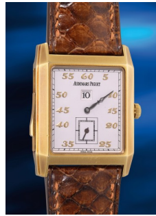
873 Audemars Piguet 愛彼，「Repetition Minutes」... 估價 HK$200,000 — 400,000