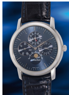
938 Audemars Piguet 愛彼，「Jules Audemars Quanti...」 估價 HK$160,000 — 320,000