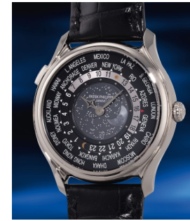
1004 Patek Philippe 百達翡麗，型號5575G-001，精... 估價 HK$500,000 — 1,000,000