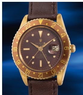
1031 Rolex 勞力士，「GMT-Master」型號1... 估價 HK$200,000 — 400,000

Hong Kong Auction / 23 May 2025 / 6:30pm HKT