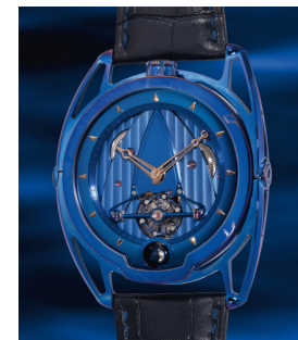
1025 De Bethune De Bethune，「DB28 Kind of Bl... 估價 HK$600,000 — 1,200,000