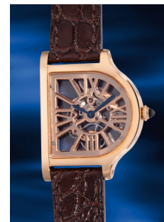
834 Cartier 卡地亞，「Cloche de Cartier Sk... 估價 HK$200,000 — 400,000