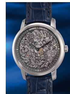
990 Vacheron Constantin 江詩丹頓, 「Métiers d'Art Méc... 估價 HK$200,000 — 360,000