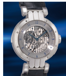
999 Harry Winston 海瑞溫斯頓，「Opus 4」型號 O...