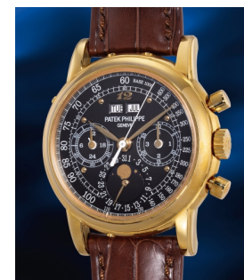
890 Patek Philippe 百達翡麗，型號3970EJ-029，... 估價 HK$3,000,000 — 5,000,000