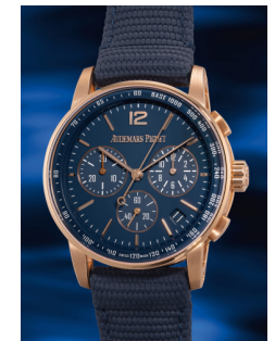
940 Audemars Piguet 愛彼，「Code 11.59 Chronograp...」 估價 HK$100,000 — 200,000