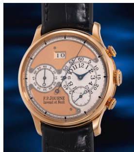
891 F.P. Journe F.P. Journe, 「Octa Chronogra... 估價 HK$500,000 — 1,000,000

Hong Kong Auction / 23 May 2025 / 6:30pm HKT