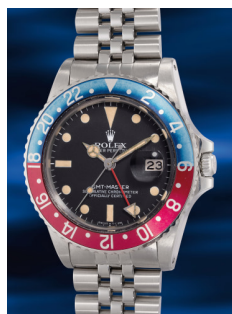
917 Rolex 勞力士，「GMT-Master」型號1... 估價 HK$80,000 — 120,000