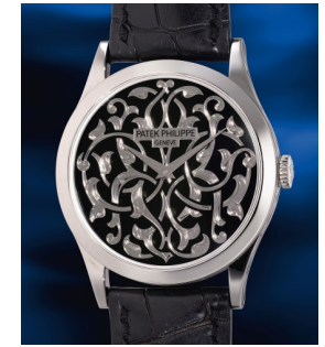
1005 Patek Philippe 百達翡麗，「Calatrava Volutes ... 估價 HK$500,000 — 800,000