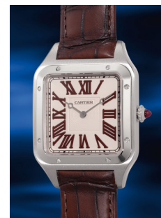
1049 Cartier 卡地亞，「Santos Dumont XL」... 估價 HK$100,000 — 200,000