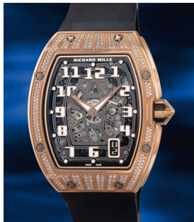
846 Richard Mille Richard Mille，「RM67-01」型... 估價 HK$600,000 — 1,200,000