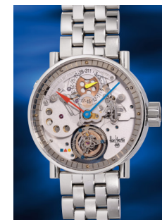
980 Alain Silberstein Alain Silberstein，「Tourbillon ... 估價 HK$120,000 — 200,000