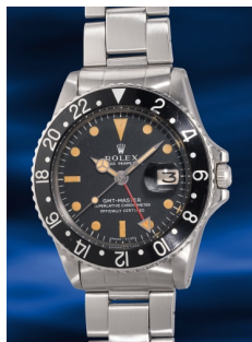
1041 Rolex 勞力士，「GMT-Master」型號1... 估價 HK$78,000 — 120,000

Hong Kong Auction / 23 May 2025 / 6:30pm HKT