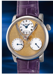
853 MB & F MB&F，「Legacy Machine Split... 估價 HK$300,000 — 600,000