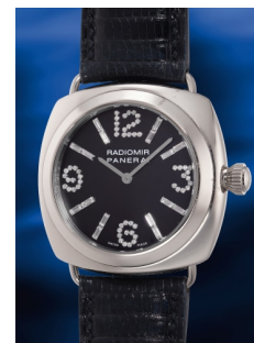
899 Panerai 沛納海, 「Radiomir, I Diamanti... 估價 HK$65,000 — 130,000