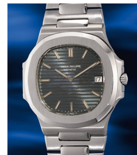
1040 Patek Philippe 百達翡麗，「Nautilus "Jumbo"」... 估價 HK$500,000 — 800,000