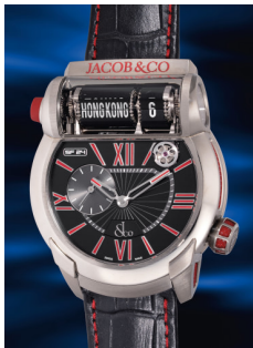
946 Jacob & Co. Jacob & Co., 「Epic SF24 Only ... 估價 HK$120,000 — 240,000