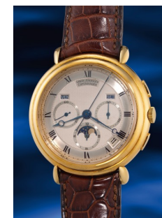
840 Urban Jürgensen Urban Jürgensen，「Reference ... 估價 HK$220,000 — 450,000