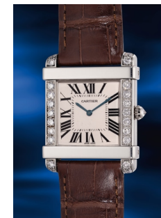
955 Cartier 卡地亞，「Tank Chinoise」型號... 估價 HK$160,000 — 320,000