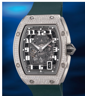
961 Richard Mille Richard Mille, 「RM67-01」型... 估價 HK$700,000 — 1,400,000

Hong Kong Auction / 23 May 2025 / 6:30pm HKT