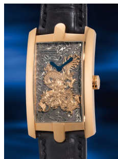
958 Harry Winston 海瑞溫斯頓，「Avenue C Midsiz... 估價 HK$60,000 — 120,000