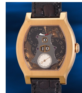
960 F.P. Journe F.P. Journe，「Vagabondage II... 估價 HK$780,000 — 1,400,000