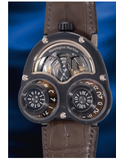
854 MB & F MB&F，「HM3 Megawind Final... 估價 HK$160,000 — 320,000