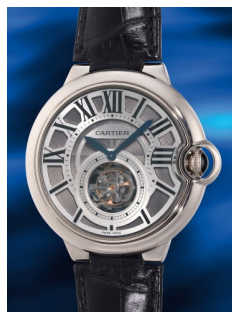
997 Cartier 卡地亞，「Ballon Bleu Tourbillo...