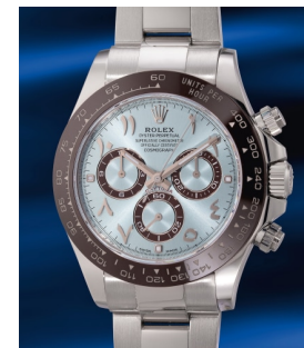
885 Rolex 勞力士，「Cosmograph Dayton... 估價 HK$780,000 — 1,600,000