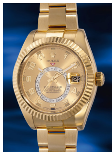
831 Rolex 勞力士，「Sky-Dweller」型號3... 估價 HK$150,000 — 300,000

Hong Kong Auction / 23 May 2025 / 6:30pm HKT