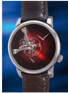
852 MB&F X H. Moser & Cie MB&F x H. Moser & Cie，型號 L... 估價 HK$240,000 — 480,000