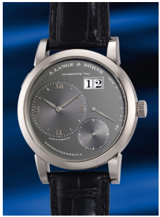
1001 A. Lange & Söhne 朗格，「Lange 1」型號 101.030... 估價 HK$100,000 — 200,000

Hong Kong Auction / 23 May 2025 / 6:30pm HKT