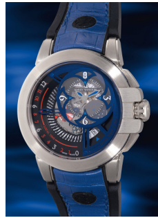
943 Harry Winston 海瑞溫斯頓, 「Ocean Dual Tim... 估價 HK$64,000 — 128,000