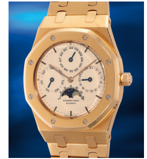
875 Audemars Piguet 愛彼，「Royal Oak Perpetual C... 估價 HK$640,000 — 1,200,000