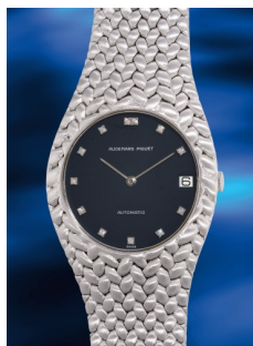
976 Audemars Piguet 愛彼，「Cobra」型號5403BC，... 估價 HK$160,000 — 240,000