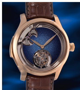
897 H. Moser & Cie 亨利慕時, 「Endeavour Conce... 估價 HK$480,000 — 960,000