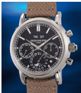
971 Patek Philippe 百達翡麗，型號5204P-011，十... 估價 HK$950,000 — 1,900,000

Hong Kong Auction / 23 May 2025 / 6:30pm HKT