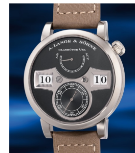
970 A. Lange & Söhne 朗格, 「Zeitwerk」型號140.02... 估價 HK$250,000 — 450,000