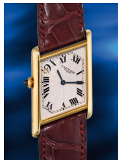
833 Cartier 卡地亞，「Tank Asymétrique "..." 估價 HK$120,000 — 200,000