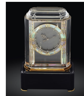
905 Cartier 卡地亞，「Modèle A」，獨一無...