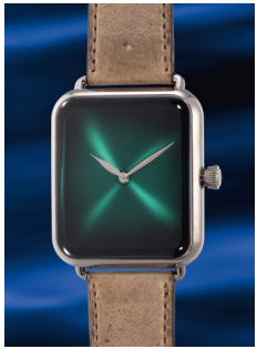
851 H. Moser & Cie 亨利慕時，「Swiss Alp Cosmic ... 估價 HK$120,000 — 200,000

Hong Kong Auction / 23 May 2025 / 6:30pm HKT