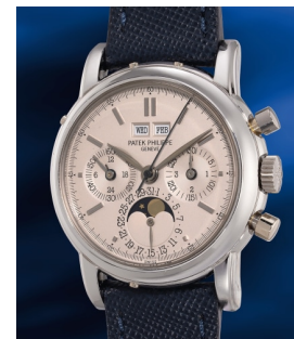
904 Patek Philippe 百達翡麗，型號3970E，十分罕...