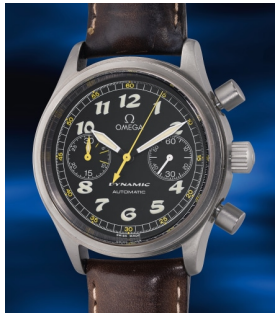
871 Omega 歐米茄，「Dynamic III」型號52... 估價 HK$40,000 — 80,000

Hong Kong Auction / 23 May 2025 / 6:30pm HKT