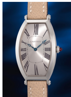
903 Cartier 卡地亞，「Tonneau」型號WGT...