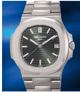
822 Patek Philippe 百達翡麗，「Nautilus」型號57... 估價 HK$900,000 — 1,700,000