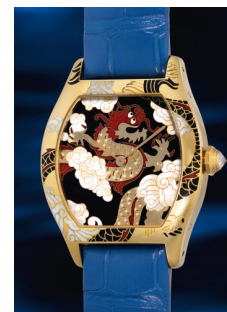
959 Cartier 卡地亞，「Tortue "Dragon"」 ... 估價 HK$155,000 — 310,000