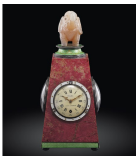
906 Cartier 卡地亞，獨一無二、卓越，粉紅...