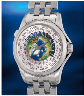
931 Patek Philippe 百達翡麗，「World Time」型號... 估價 HK$720,000 — 1,440,000

Hong Kong Auction / 23 May 2025 / 6:30pm HKT