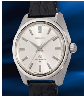
872 Grand Seiko Grand Seiko，「44GS」型號44... 估價 HK$75,000 — 150,000