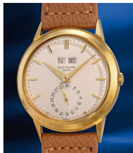
913 Patek Philippe 百達翡麗，「Padellone, 'Senza ... 估價 HK$1,200,000 — 2,400,000