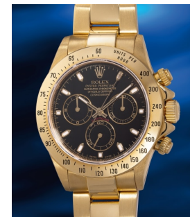
1045 Rolex 勞力士，「Cosmograph Dayton... 估價 HK$230,000 — 460,000