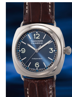
900 Panerai 沛納海, 「Radiomir Indepe... 估價 HK$70,000 — 140,000