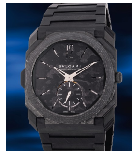
1024 Bulgari 寶格麗，「Octo Finissimo Minu... 估價 HK$320,000 — 640,000