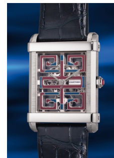
954 Cartier 卡地亞，「Tank Chinoise, Cartie... 估價 HK$160,000 — 320,000