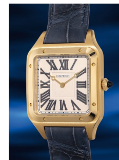
1050 Cartier 卡地亞，「Santos-Dumont XL... 估價 HK$120,000 — 200,000