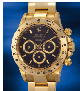
1022 Rolex 勞力士，「Cosmograph Dayton... 估價 HK$170,000 — 350,000