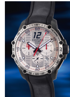
949 Chopard 蕭邦, 「Superfast Chrono Pors... 估價 HK$40,000 — 80,000