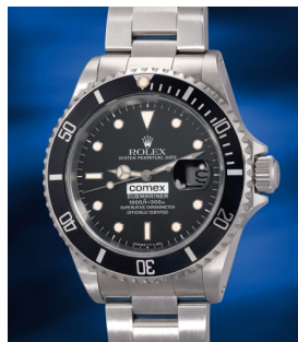
1043 Rolex 勞力士，「Submariner "COMEX..." 估價 HK$450,000 — 950,000