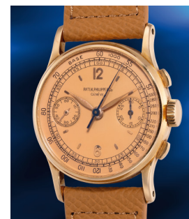
909 Patek Philippe 百達翡麗，型號130，十分精細...