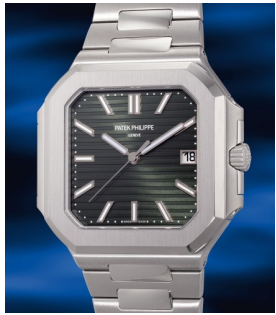
821 Patek Philippe 百達翡麗，「Cubitus」型號582... 估價 HK$320,000 — 600,000

Hong Kong Auction / 23 May 2025 / 6:30pm HKT