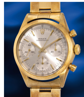
914 Rolex 勞力士，「"Pre-Daytona"」型... 估價 HK$240,000 — 400,000