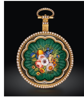
814 Barraud Barraud，「Bouquets de Chin... 估價 HK$80,000 — 160,000