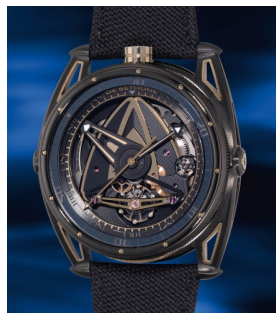
892 De Bethune De Bethune, 「DBS28GS JPS」... 估價 HK$400,000 — 650,000