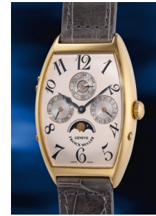
874 Franck Muller Franck Muller，型號2850 QP，... 估價 HK$50,000 — 100,000