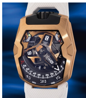
1026 Urwerk Urwerk，「UR-220 "Miami Vib... 估價 HK$400,000 — 800,000