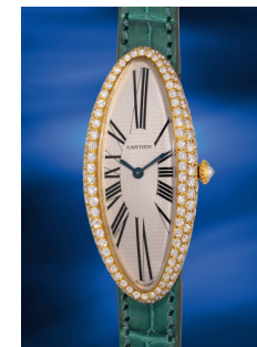
995 Cartier 卡地亞，「Baignoire Allongée...