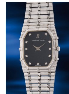
975 Audemars Piguet 愛彼，「Bamboo」型號，精細，... 估價 HK$80,000 — 150,000