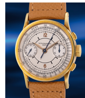
1030 Patek Philippe 百達翡麗，型號533，精細罕有... 估價 HK$800,000 — 1,600,000