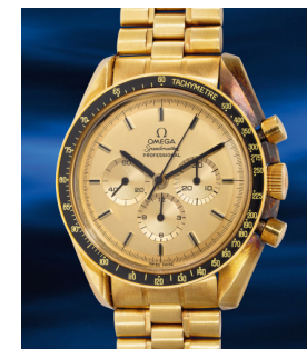
870 Omega 歐米茄, 「Speedmaster Profes... 估價 HK$120,000 — 240,000