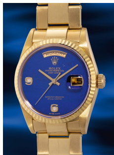
881 Rolex 勞力士，「Day-Date」型號182... 估價 HK$150,000 — 240,000

Hong Kong Auction / 23 May 2025 / 6:30pm HKT