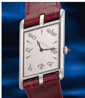
901 Cartier 卡地亞，「Tank Asymétrique "S...

Hong Kong Auction / 23 May 2025 / 6:30pm HKT