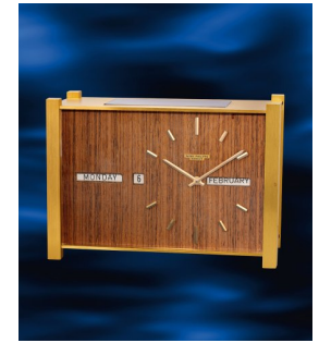
855 Patek Philippe 百達翡麗，型號503，方形鍍金... 估價 HK$95,000 — 190,000