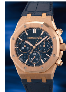
939 Audemars Piguet 愛彼，「Royal Oak Chronograp...」 估價 HK$250,000 — 450,000