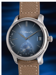
896 H. Moser & Cie 亨利慕時, 「Endeavour Perpet... 估價 HK$120,000 — 200,000