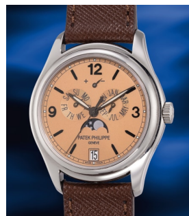
1057 Patek Philippe 百達翡麗，「Advanced Researc... 估價 HK$240,000 — 480,000