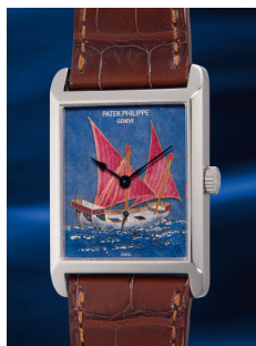
956 Patek Philippe 百達翡麗，「Gondolo, Barque 4... 估價 HK$250,000 — 500,000