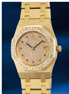
1021 Audemars Piguet 愛彼，皇家橡樹型號66344BA.Z... 估價 HK$78,000 — 155,000

Hong Kong Auction / 23 May 2025 / 6:30pm HKT