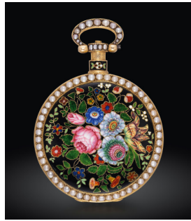
813 Just & Son Just & Son，「Bouquets de Chi... 估價 HK$80,000 — 160,000