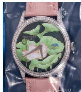
952 Patek Philippe 百達翡麗，「Calatrava, Fleur d'... 估價 HK$400,000 — 800,000