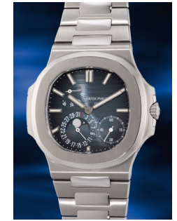
935 Patek Philippe 百達翡麗，「Nautilus」型號571... 估價 HK$320,000 — 640,000