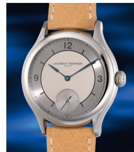
894 Laurent Ferrier Laurent Ferrier, 「Classic Origi... 估價 HK$160,000 — 320,000