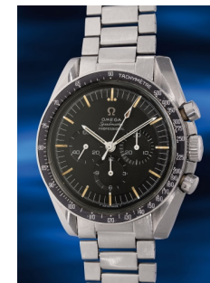
865 Omega 歐米茄, 「Speedmaster Profes... 估價 HK$64,000 — 128,000