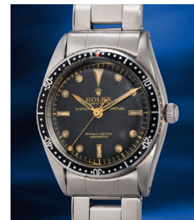
1035 Rolex 勞力士，「Turn-O-graph」型號... 估價 HK$75,000 — 150,000