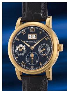
838 A. Lange & Söhne 朗格，「Langematik Perpetual,..." 估價 HK$270,000 — 500,000