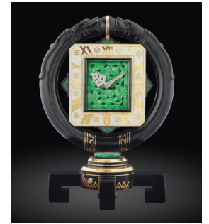
815 Cartier 卡地亞，獨一無二、重要、卓越... 估價 HK$1,200,000 — 2,400,000