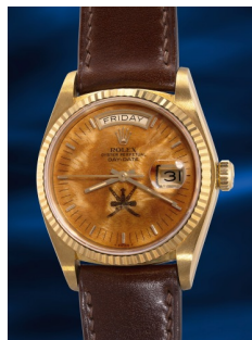
882 Rolex 勞力士，「Day-Date」型號180... 估價 HK$160,000 — 300,000