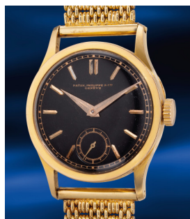
908 Patek Philippe 百達翡麗，「Calatrava」型號9...