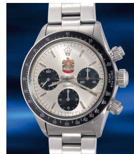
884 Rolex 勞力士，「Cosmograph Dayton... 估價 HK$1,200,000 — 2,400,000