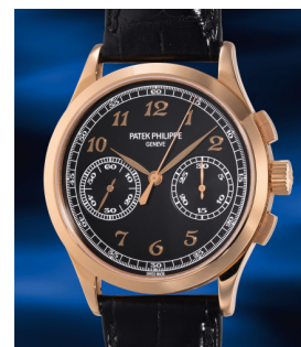
889 Patek Philippe 百達翡麗，型號 5170R-010，精... 估價 HK$240,000 — 400,000