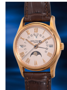
985 Patek Philippe 百達翡麗, 型號5050, 十分精細... 估價 HK$200,000 — 400,000