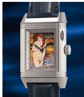
953 Jaeger-LeCoultre 積家，「Reverso à éclipses "Fa... 估價 HK$150,000 — 250,000