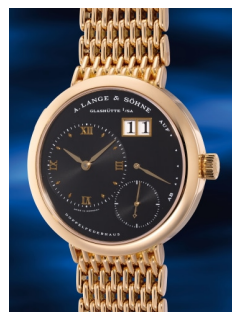
837 A. Lange & Söhne 朗格，「Lange 1 "Wellendorff"..." 估價 HK$140,000 — 280,000