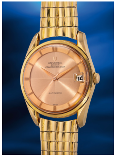
1011 Universal Genève 宇宙，「Polerouter Date "Pink ... 估價 HK$40,000 — 80,000

Hong Kong Auction / 23 May 2025 / 6:30pm HKT