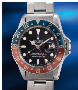
916 Rolex 勞力士，「GMT-Master, MK 0 ... 估價 HK$120,000 — 240,000