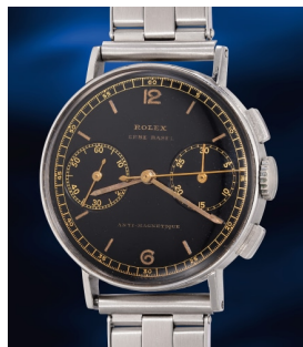
863 Rolex 勞力士, 「Chronographe Antim... 估價 HK$380,000 — 620,000