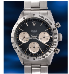
915 Rolex A very fine and rare stainless ste... Estimate HK$630,000 — 1,300,000