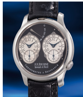
848 F.P. Journe An ultra exclusive and rare limit... Estimate HK$1,200,000 — 2,400,000