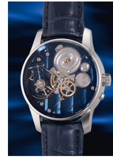
964 Moritz Grossmann A mesmerizing and rare limited ... Estimate HK$120,000 — 200,000