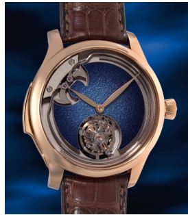
897 H. Moser & Cie A rare and contemporary limite... Estimate HK$480,000 — 960,000