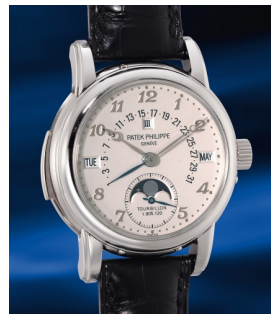
1058 Patek Philippe An exceedingly rare and import... Estimate HK$3,000,000 — 6,000,000