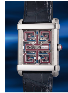
954 Cartier A very rare and elegant limited ... Estimate HK$160,000 — 320,000