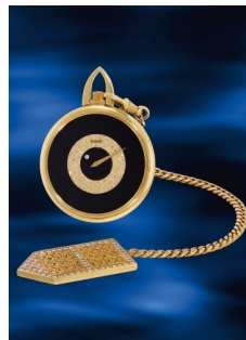
868 Piaget A well-preserved, highly rare an... Estimate HK$24,000 — 40,000