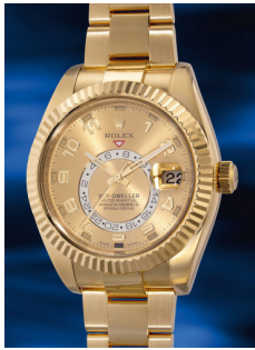
831 Rolex A hefty, fine and attractive yellow... Estimate HK$150,000 — 300,000

Hong Kong Auction / 23 May 2025 / 6:30pm HKT