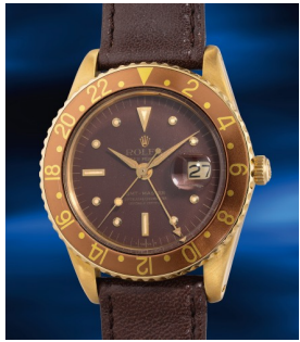
1031 Rolex A well-preserved, early and rare... Estimate HK$200,000 — 400,000

Hong Kong Auction / 23 May 2025 / 6:30pm HKT