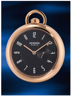
951 Hermès A unique and innovative pink go... Estimate HK$40,000 — 80,000

Hong Kong Auction / 23 May 2025 / 6:30pm HKT