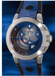
943 Harry Winston A unique, impressive and "like-n... Estimate HK$64,000 — 128,000