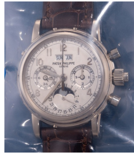
857 Patek Philippe An exceedingly rare, important ... Estimate HK$1,500,000 — 3,000,000