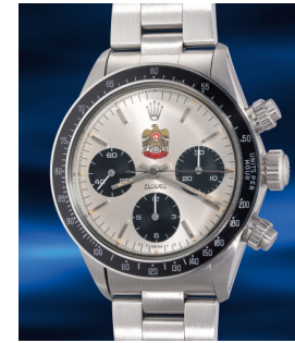
884 Rolex An extremely rare, well-preserv... Estimate HK$1,200,000 — 2,400,000