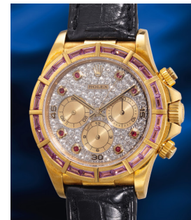
829 Rolex An extremely well-preserved, hi... Estimate HK$600,000 — 1,200,000