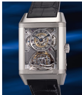
998 Jaeger-LeCoultre A very rare and complicated limi... Estimate HK$470,000 — 930,000