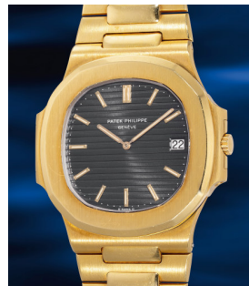
867 Patek Philippe A well-preserved, very rare and ... Estimate HK$750,000 — 1,500,000