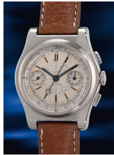
862 Universal Genève A highly rare and early Enverste... Estimate HK$120,000 — 250,000