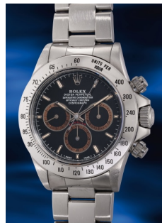
828 Rolex A very rare, well-preserved and ... Estimate HK$230,000 — 380,000