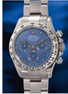
973 Rolex A rare and attractive white gold ... Estimate HK$240,000 — 400,000