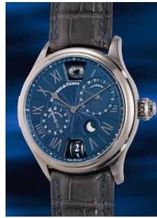
963 Maitres du Temps by ... A possibly unique, intricate and ... Estimate HK$200,000 — 400,000