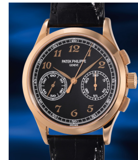
889 Patek Philippe A very attractive and elegant pi... Estimate HK$240,000 — 400,000