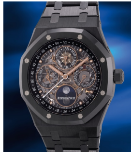
1023 Audemars Piguet A "like-new", highly impressive, ... Estimate HK$2,000,000 — 3,200,000