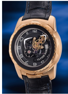
1027 Ulysse Nardin A fine and unusual pink gold wri... Estimate HK$120,000 — 200,000