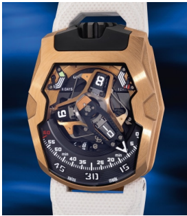
1026 Urwerk A "like-new", rare and innovativ... Estimate HK$400,000 — 800,000