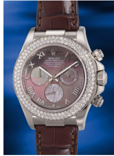
972 Rolex A rare and unusual white gold c... Estimate HK$200,000 — 400,000