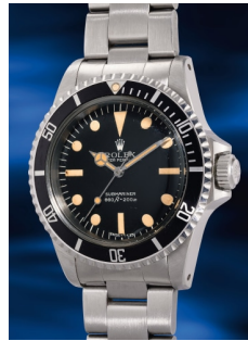
918 Rolex A well-preserved and robust sta... Estimate HK$65,000 — 100,000