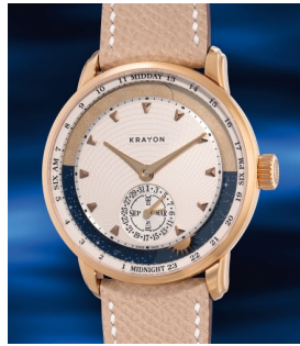
893 Krayon An innovative and attractive pin... Estimate HK$700,000 — 1,400,000