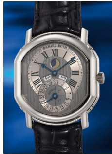
982 Daniel Roth A very well-preserved and rare ... Estimate HK$200,000 — 400,000