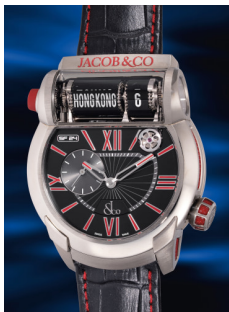
946 Jacob & Co. A unique and innovative titaniu... Estimate HK$120,000 — 240,000