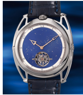
962 De Bethune An extremely fine and mesmeriz... Estimate HK$320,000 — 480,000