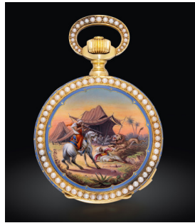
807 L. Vrad & Co. An exceptionally rare, highly im... Estimate HK$800,000 — 1,600,000