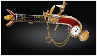
801 Attributed to Moulini... An extremely rare, important an... Estimate HK$800,000 — 1,600,000