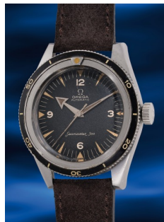
1037 Omega An early, very fine and attractiv... Estimate HK$80,000 — 160,000