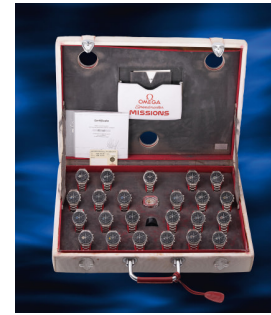
1044 Omega A rare and exceptional limited e... Estimate HK$450,000 — 750,000