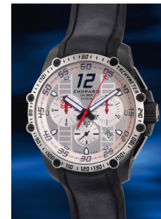
949 Chopard A unique, attractive and "like-n... Estimate HK$40,000 — 80,000