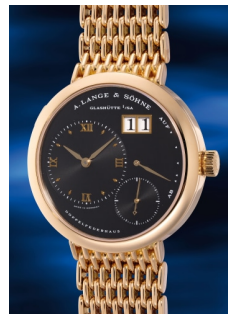
837 A. Lange & Söhne A highly rare and attractive pink... Estimate HK$140,000 — 280,000