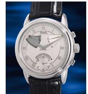
1000 Piaget An extremely attractive and the ... Estimate HK$1,400,000 — 2,400,000