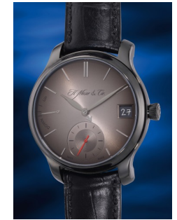
945 H. Moser & Cie A unique and "like-new" black D... Estimate HK$96,000 — 190,000