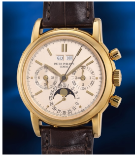
856 Patek Philippe An exceptionally well-preserved... Estimate HK$1,500,000 — 3,000,000