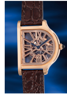
834 Cartier A very rare and attractive limited... Estimate HK$200,000 — 400,000