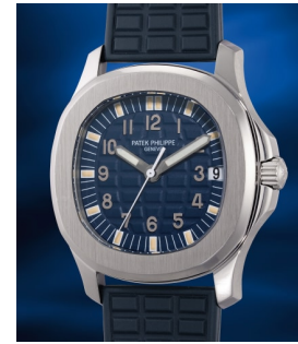
824 Patek Philippe An attractive limited edition stai... Estimate HK$350,000 — 550,000