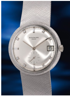
911 Patek Philippe An extremely rare and attractiv... Estimate HK$120,000 — 240,000

Hong Kong Auction / 23 May 2025 / 6:30pm HKT