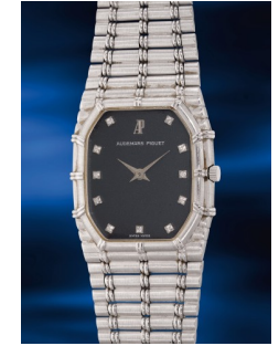
975 Audemars Piguet An attractive and rare white gol... Estimate HK$80,000 — 150,000