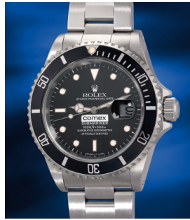
1043 Rolex A very well-preserved and rare s... Estimate HK$450,000 — 950,000