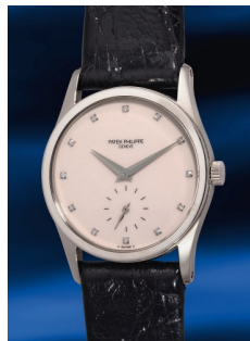
1017 Patek Philippe A very fine and elegant white go... Estimate HK$80,000 — 160,000