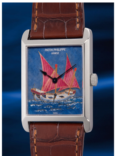
956 Patek Philippe A highly attractive and rare plat... Estimate HK$250,000 — 500,000