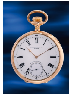
1008 Patek Philippe A very well-preserved pink gold ... Estimate HK$64,000 — 128,000