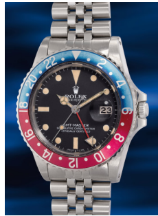
917 Rolex An early, well-preserved and att... Estimate HK$80,000 — 120,000