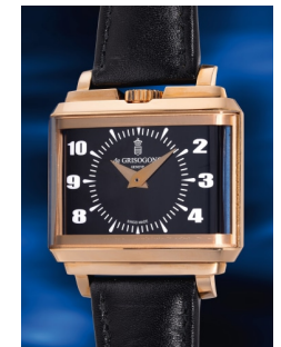
950 De Grisogono A unique, intriguing and elegant... Estimate HK$40,000 — 80,000