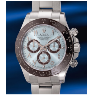
885 Rolex A highly rare and attractive plat... Estimate HK$780,000 — 1,600,000