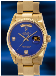
881 Rolex A very attractive and well-prese... Estimate HK$150,000 — 240,000

Hong Kong Auction / 23 May 2025 / 6:30pm HKT