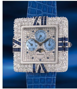
923 Audemars Piguet A highly rare, possibly unique a... Estimate HK$320,000 — 640,000