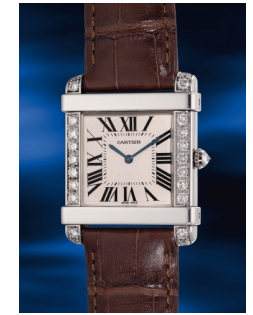
955 Cartier A rare and elegant platinum an... Estimate HK$160,000 — 320,000