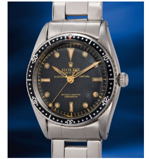
1035 Rolex A very well-preserved and rare s... Estimate HK$75,000 — 150,000