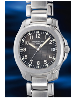
934 Patek Philippe A fine and attractive stainless st... Estimate HK$160,000 — 320,000