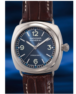
900 Panerai An incredibly rare and unusual li... Estimate HK$70,000 — 140,000