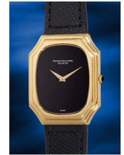
1015 Patek Philippe A highly attractive, rare and unu... Estimate HK$150,000 — 250,000