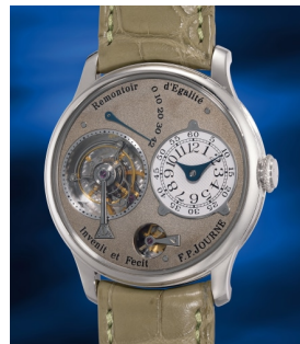
847 F.P. Journe An extremely rare, well-preserv... Estimate HK$1,720,000 — 2,800,000