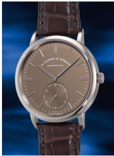
991 A. Lange & Söhne A well-preserved and highly rar... Estimate HK$90,000 — 180,000

Hong Kong Auction / 23 May 2025 / 6:30pm HKT