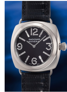
899 Panerai A rare and attractive limited edi... Estimate HK$65,000 — 130,000