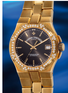
978 Vacheron Constantin A very rare and attractive yello... Estimate HK$100,000 — 200,000