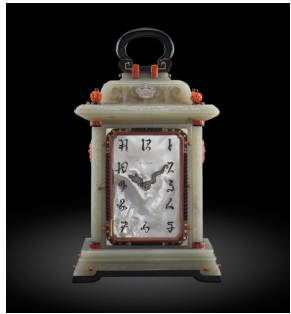
806 Cartier An exceptional, unique and mus... Estimate HK$960,000 — 1,920,000