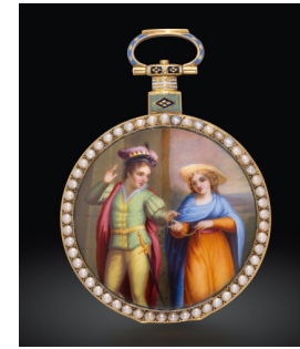
804 Ilbery A highly rare and attractive pea... Estimate HK$160,000 — 320,000