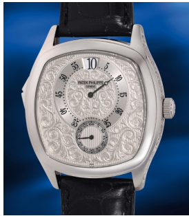
1006 Patek Philippe An exceptional and rare limited ... Estimate HK$2,300,000 — 3,000,000