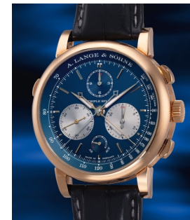
839 A. Lange & Söhne A rare, impressive and highly at... Estimate HK$650,000 — 1,000,000