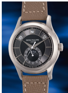
1056 Patek Philippe A rare and attractive white gold ... Estimate HK$160,000 — 320,000