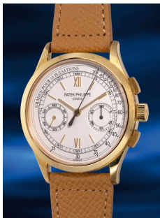
986 Patek Philippe A fine and attractive yellow gold... Estimate HK$200,000 — 360,000