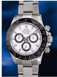
817 Rolex A sought-after and attractive st... Estimate HK$95,000 — 180,000