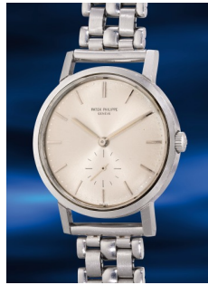
912 Patek Philippe A sleek, attractive and well pres... Estimate HK$120,000 — 240,000