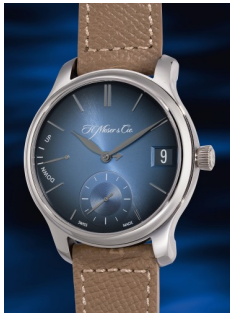
896 H. Moser & Cie A possibly unique and unusual p... Estimate HK$120,000 — 200,000