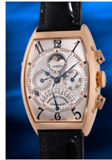
983 Franck Muller A well-preserved and attractive ... Estimate HK$90,000 — 150,000