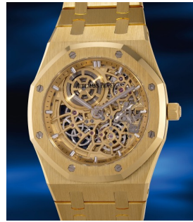
832 Audemars Piguet A "like-new" and attractive yellow... Estimate HK$600,000 — 1,000,000