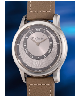
895 Romain Gauthier An avant-garde and attractive li... Estimate HK$120,000 — 200,000