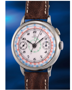
860 Omega A highly rare and attractive sing... Estimate HK$120,000 — 240,000