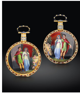
803 Edouard Juvet A highly elaborate and exceptio... Estimate HK$400,000 — 800,000