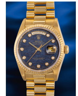
1020 Rolex An incredibly rare and exquisite ... Estimate HK$190,000 — 250,000