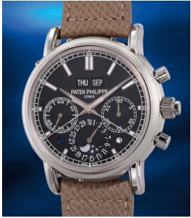
971 Patek Philippe A very fine and highly attractive ... Estimate HK$950,000 — 1,900,000

Hong Kong Auction / 23 May 2025 / 6:30pm HKT