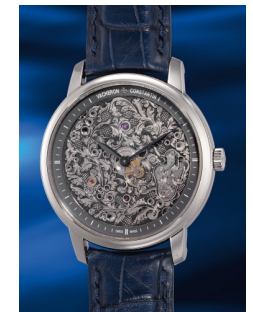
990 Vacheron Constantin A rare and exquisite semi-skelet... Estimate HK$200,000 — 360,000