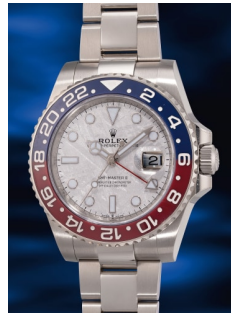
818 Rolex A very fine and attractive white ... Estimate HK$240,000 — 480,000