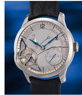
1029 Greubel Forsey An exceptional and rare limited ... Estimate HK$750,000 — 1,200,000