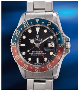
916 Rolex A highly interesting, extremely ... Estimate HK$120,000 — 240,000