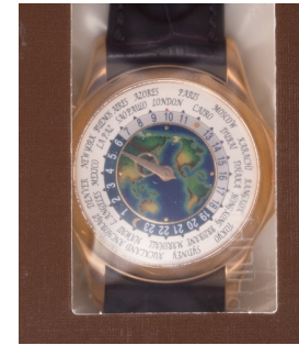
984 Patek Philippe A very rare and attractive pink g... Estimate HK$550,000 — 1,100,000