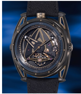
892 De Bethune A highly impressive, innovative ... Estimate HK$400,000 — 650,000