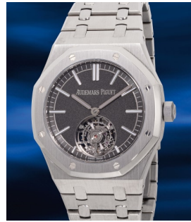
1053 Audemars Piguet A very fine and attractive titaniu... Estimate HK$600,000 — 1,100,000