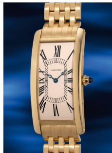
1047 Cartier A highly attractive and rare limi... Estimate HK$200,000 — 400,000