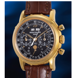
890 Patek Philippe A "like-new", exceptionally rare ... Estimate HK$3,000,000 — 5,000,000