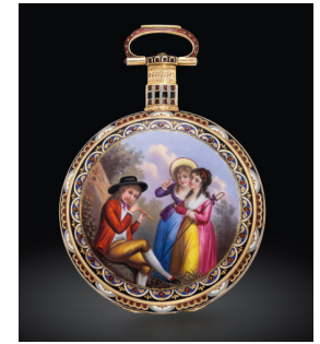
805 Edouard Juvet A lavishly decorated and well-pr... Estimate HK$160,000 — 320,000