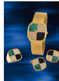
869 Omega An extremely rare and attractiv... Estimate HK$64,000 — 128,000