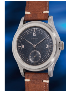
859 Longines A rare and early stainless steel a... Estimate HK$50,000 — 80,000