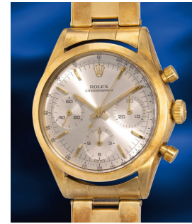
914 Rolex A very well-preserved and striki... Estimate HK$240,000 — 400,000