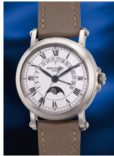
992 Patek Philippe A fine and well-preserved white ... Estimate HK$200,000 — 360,000