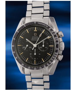
865 Omega A rare and attractive stainless s... Estimate HK$64,000 — 128,000