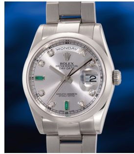
1052 Rolex A rare and highly attractive whit... Estimate HK$140,000 — 240,000