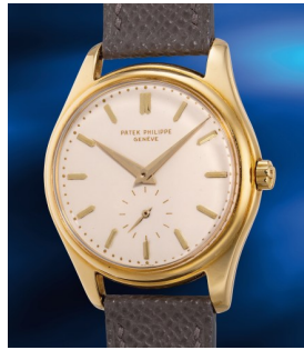
1032 Patek Philippe An early, highly attractive and el... Estimate HK$200,000 — 360,000