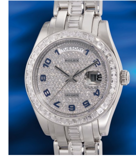
974 Rolex A dazzling, lavish and very rare ... Estimate HK$480,000 — 960,000