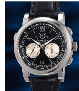
969 A. Lange & Söhne An impressive platinum split-se... Estimate HK$390,000 — 780,000