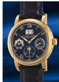
838 A. Lange & Söhne An extremely fine and rare limited... Estimate HK$270,000 — 500,000