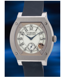
845 F.P. Journe A "like-new", sought-after and i... Estimate HK$240,000 — 400,000