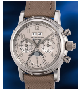
987 Patek Philippe A highly important, rare and ele... Estimate HK$1,200,000 — 2,400,000