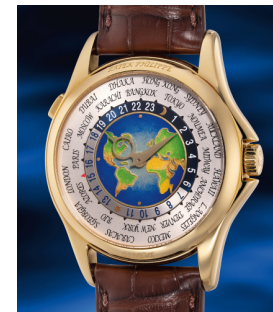
989 Patek Philippe A very fine and attractive yellow... Estimate HK$560,000 — 640,000