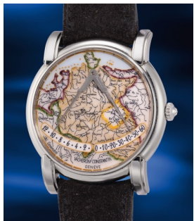
876 Vacheron Constantin An extremely rare and intricate l... Estimate HK$240,000 — 480,000