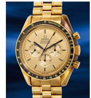
870 Omega A very rare and well-preserved y... Estimate HK$120,000 — 240,000