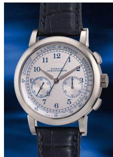
968 A. Lange & Söhne A refined and elegant white gol... Estimate HK$240,000 — 480,000