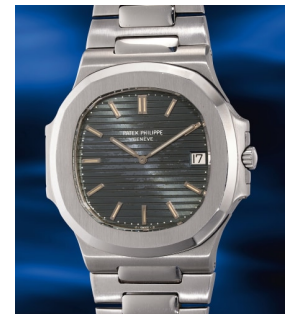
1040 Patek Philippe A rare and attractive stainless s... Estimate HK$500,000 — 800,000