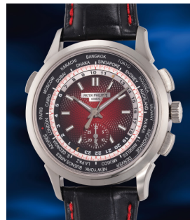
928 Patek Philippe A highly rare and attractive limi... Estimate HK$400,000 — 600,000