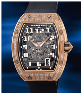
846 Richard Mille A "like-new", very fine and extra... Estimate HK$600,000 — 1,200,000