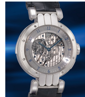
999 Harry Winston An extremely rare, very fine and... Estimate HK$480,000 — 960,000