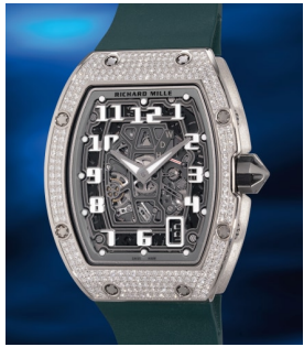
961 Richard Mille A very fine and extravagant whi... Estimate HK$700,000 — 1,400,000

Hong Kong Auction / 23 May 2025 / 6:30pm HKT