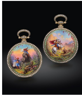
808 Edouard Juvet A highly rare, exceptionally fine ... Estimate HK$80,000 — 160,000