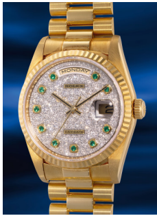
921 Rolex A very fine and exquisite yellow ... Estimate HK$150,000 — 240,000

Hong Kong Auction / 23 May 2025 / 6:30pm HKT