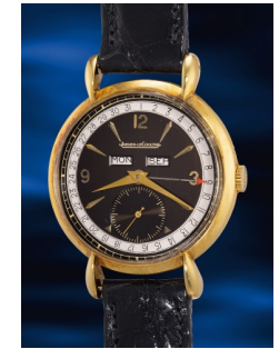
1010 Jaeger-LeCoultre A well-preserved and attractive ... Estimate HK$40,000 — 65,000