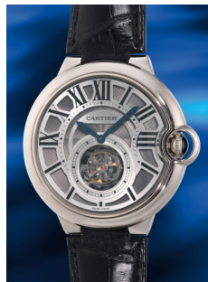
997 Cartier A fine and rare white gold flying ... Estimate HK$200,000 — 240,000