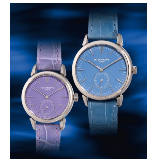
930 Patek Philippe A pair of highly rare and attracti... Estimate HK$300,000 — 500,000