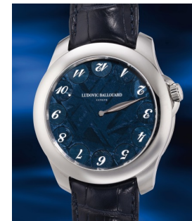
849 Ludovic Ballouard A unique, attractive and innovat... Estimate HK$200,000 — 360,000