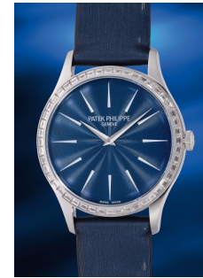
844 Patek Philippe A lady's dazzling, rare and "like-... Estimate HK$100,000 — 200,000