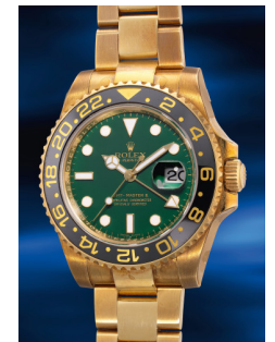
830 Rolex A very rare and well-preserved y... Estimate HK$150,000 — 300,000