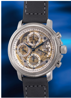
981 Credor A very rare and attractive platin... Estimate HK$60,000 — 125,000

Hong Kong Auction / 23 May 2025 / 6:30pm HKT