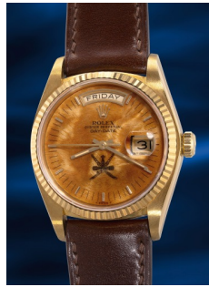
882 Rolex A very rare and well-preserved y... Estimate HK$160,000 — 300,000