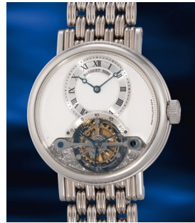
842 Breguet An exceptionally rare and highly- Estimate HK$250,000 — 400,000