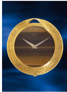
1012 Piaget A very well-preserved and rare y... Estimate HK$16,000 — 24,000