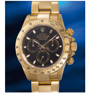
1045 Rolex An unusual and early yellow gol... Estimate HK$230,000 — 460,000