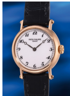
1018 Patek Philippe A fine and elegant lady's pink g... Estimate HK$40,000 — 80,000