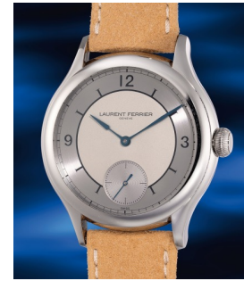
894 Laurent Ferrier A very rare and attractive limite... Estimate HK$160,000 — 320,000