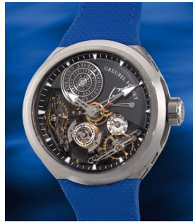
898 Greubel Forsey An ergonomic and impressive li... Estimate HK$800,000 — 1,600,000