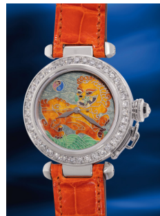
957 Cartier A highly rare and playful limited... Estimate HK$120,000 — 240,000