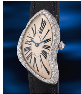
843 Cartier A rare and unusual white gold a... Estimate HK$780,000 — 1,560,000