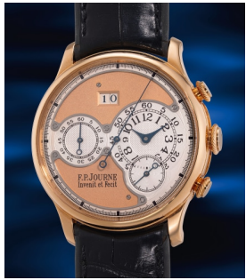
891 F.P. Journe A striking, very rare and well-pr... Estimate HK$500,000 — 1,000,000

Hong Kong Auction / 23 May 2025 / 6:30pm HKT