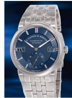
819 A. Lange & Söhne A "new-old-stock" stainless ste... Estimate HK$200,000 — 400,000