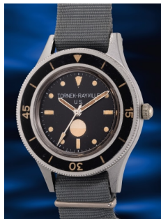
1036 Tornek-Rayville An extremely rare and historical... Estimate HK$100,000 — 200,000