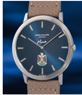
883 Patek Philippe A highly rare and attractive whit... Estimate HK$80,000 — 160,000