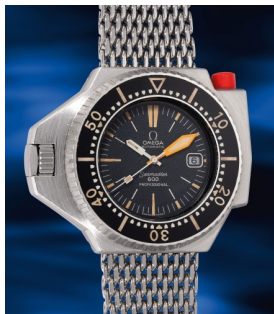
866 Omega An impressive and historically i... Estimate HK$160,000 — 320,000