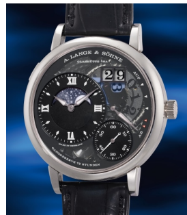
887 A. Lange & Söhne A very attractive, sought-after a... Estimate HK$320,000 — 640,000