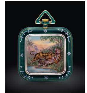
810 Attributed to Ernest V... An incredibly attractive, rare an... Estimate HK$80,000 — 160,000