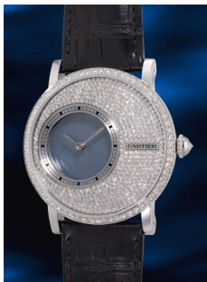
996 Cartier A well-preserved and extrava... Estimate HK$120,000 — 240,000