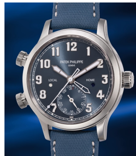
927 Patek Philippe A "like-new", rare and sporty li... Estimate HK$160,000 — 320,000