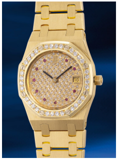
1021 Audemars Piguet A lady's fine, well-preserved an... Estimate HK$78,000 — 155,000

Hong Kong Auction / 23 May 2025 / 6:30pm HKT