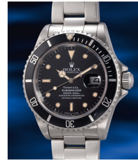
919 Rolex A rare and attractive stainless s... Estimate HK$120,000 — 240,000