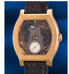
960 E.P. Journe A very fine and rare limited editi... Estimate HK$780,000 — 1,400,000