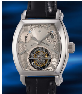
877 Vacheron Constantin A well-preserved and attractive ... Estimate HK$240,000 — 480,000