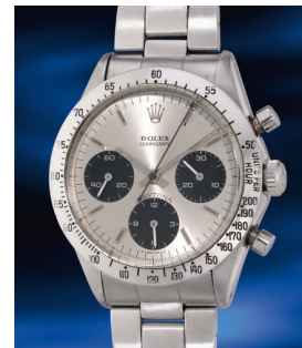
1039 Rolex A rare and well-preserved stainl... Estimate HK$270,000 — 530,000