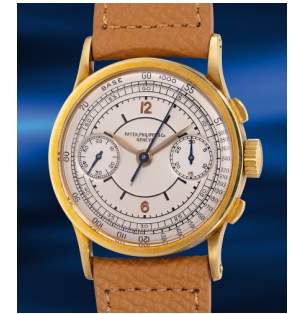
1030 Patek Philippe An extremely rare, well-preserv... Estimate HK$800,000 — 1,600,000