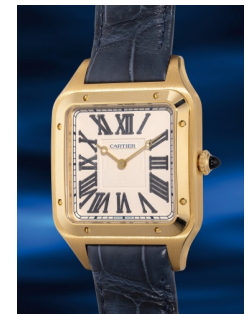
1050 Cartier A highly attractive limited editio... Estimate HK$120,000 — 200,000