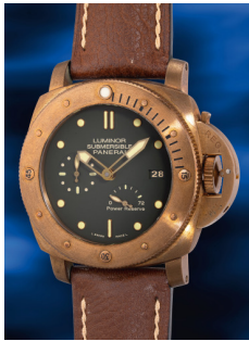
941 Panerai An attractive and oversized limi... Estimate HK$60,000 — 120,000

Hong Kong Auction / 23 May 2025 / 6:30pm HKT