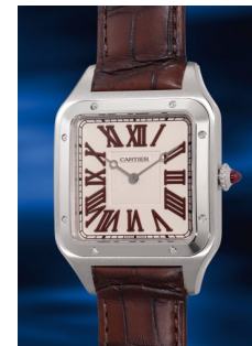
1049 Cartier A "like-new", very rare and attr... Estimate HK$100,000 — 200,000