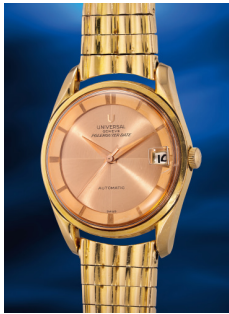
1011 Universal Genève A very well-preserved and attra... Estimate HK$40,000 — 80,000

Hong Kong Auction / 23 May 2025 / 6:30pm HKT