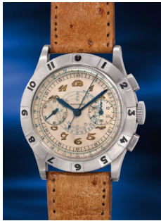
861 Movado A very early, attractive and well... Estimate HK$62,000 — 150,000

Hong Kong Auction / 23 May 2025 / 6:30pm HKT