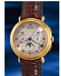
840 Urban Jürgensen A well-preserved and pioneering... Estimate HK$220,000 — 450,000