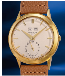
913 Patek Philippe A historically important and unu... Estimate HK$1,200,000 — 2,400,000