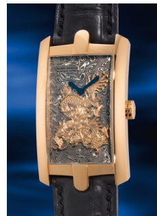
958 Harry Winston A unique and oriental pink gold ... Estimate HK$60,000 — 120,000