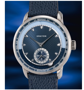
965 Krayon A very innovative and intriguing... Estimate HK$700,000 — 1,400,000