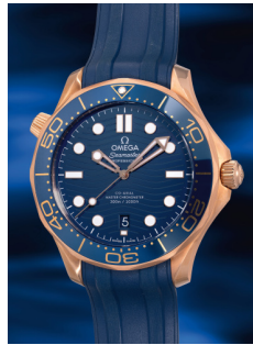
942 Omega A "like-new", unworn and attrac... Estimate HK$60,000 — 120,000