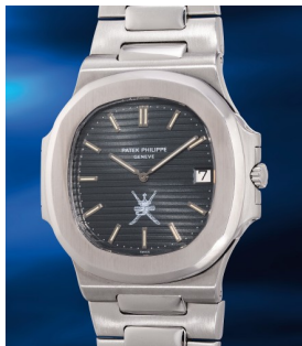
886 Patek Philippe An exceptionally rare and impor... Estimate HK$3,900,000 — 7,500,000