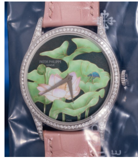
952 Patek Philippe A very attractive and rare white ... Estimate HK$400,000 — 800,000