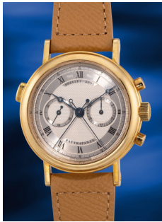
841 Richard Mille A very fine, attractive and well- Estimate HK$100,000 — 200,000

Hong Kong Auction / 23 May 2025 / 6:30pm HKT