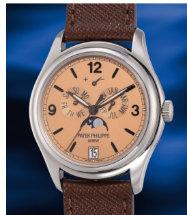
1057 Patek Philippe A very fine, rare and well-preser... Estimate HK$240,000 — 480,000