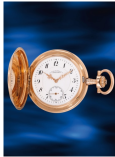
1007 A. Lange & Söhne A fine and attractive 14K pink g... Estimate HK$30,000 — 50,000