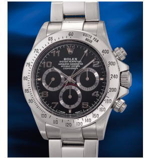
920 Rolex The only one known and well-pr... Estimate HK$800,000 — 1,600,000