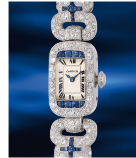
1009 Cartier A lady’s magnificent and except... Estimate HK$120,000 — 240,000