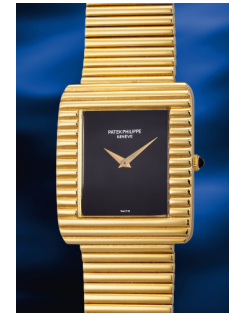
1014 Patek Philippe A rare and attractive yellow gol... Estimate HK$80,000 — 160,000