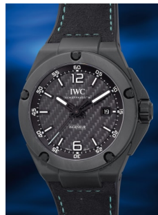
948 IWC A unique, attractive and "like-n... Estimate HK$40,000 — 80,000