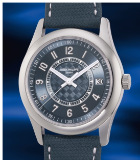
926 Patek Philippe A "like-new" and rare limited ed... Estimate HK$160,000 — 320,000