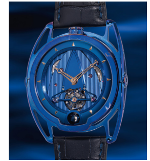
1025 De Bethune An avant-garde and extremely ... Estimate HK$600,000 — 1,200,000