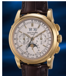
988 Patek Philippe A highly rare and attractive yell... Estimate HK$780,000 — 1,560,000