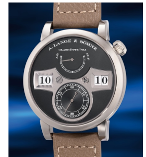
970 A. Lange & Söhne A fine and rare white gold wrist... Estimate HK$250,000 — 450,000