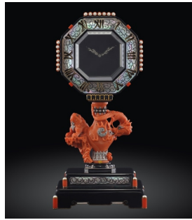
802 Cartier A unique, extremely rare, impre... Estimate HK$2,000,000 — 4,000,000