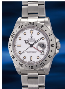
827 Rolex A fine and well-preserved stainl... Estimate HK$60,000 — 100,000