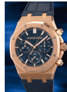
939 Audemars Piguet A "like-new", attractive and rar... Estimate HK$250,000 — 450,000