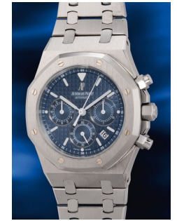
825 Audemars Piguet An attractive and rare stainless ... Estimate HK$120,000 — 200,000