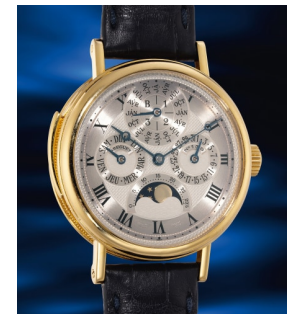
880 Breguet A complicated and well-preserv... Estimate HK$640,000 — 1,280,000