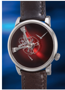
852 MB&F X H. Moser &... A very fine and rare limited editi... Estimate HK$240,000 — 480,000