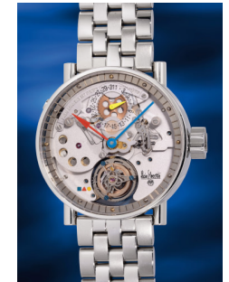
980 Alain Silberstein A rare and unusual limited editi... Estimate HK$120,000 — 200,000