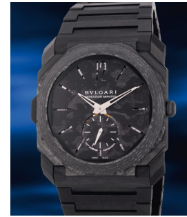
1024 Bulgari A "like-new", impressive and lig... Estimate HK$320,000 — 640,000