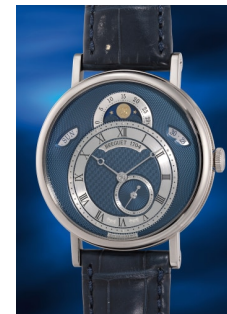
879 Breguet An elegant and attractive white ... Estimate HK$80,000 — 200,000