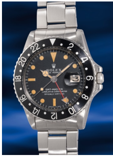
1041 Rolex A well-preserved and attractive ... Estimate HK$78,000 — 120,000

Hong Kong Auction / 23 May 2025 / 6:30pm HKT