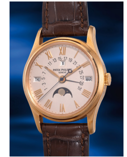
985 Patek Philippe A very fine and rare pink gold pe... Estimate HK$200,000 — 400,000