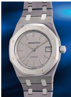
826 Audemars Piguet A very rare and attractive two-t... Estimate HK$120,000 — 220,000