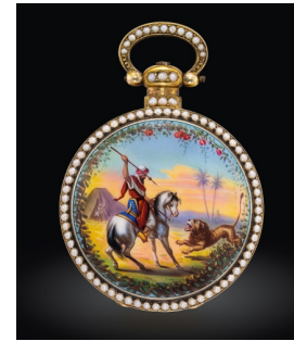
809 Edouard Juvet A highly rare and attractive pea... Estimate HK$80,000 — 160,000