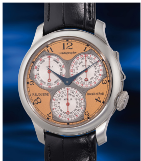
966 F.P. Journe A very rare and attractive platin... Estimate HK$480,000 — 960,000