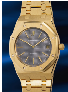
977 Audemars Piguet An extremely rare and well-pres... Estimate HK$300,000 — 500,000