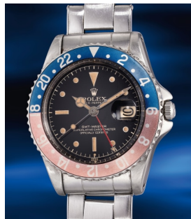
1038 Rolex A very rare and attractive stainl... Estimate HK$200,000 — 360,000