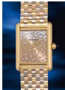
1048 Cartier A rare and attractive yellow gol... Estimate HK$100,000 — 200,000