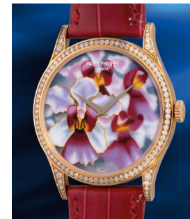
929 Patek Philippe A very fine and rare limited editi... Estimate HK$480,000 — 960,000