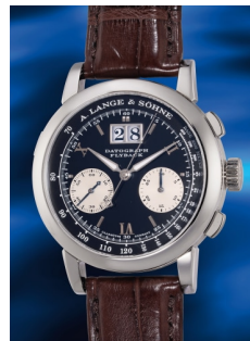
967 A. Lange & Söhne A well-preserved and attractive ... Estimate HK$250,000 — 500,000