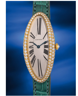
995 Cartier A rare and attractive yellow gol... Estimate HK$60,000 — 120,000