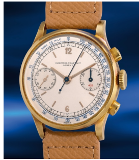
1033 Audemars Piguet A very rare and well-preserved y... Estimate HK$240,000 — 400,000