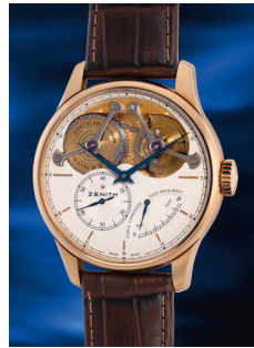
1028 Zenith A rare, well-preserved and limit... Estimate HK$150,000 — 300,000