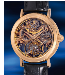
979 Vacheron Constantin A mesmerizing and very rare pin... Estimate HK$270,000 — 500,000