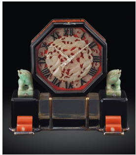
816 Van Cleef & Arpels A rare and attractive yellow gol... Estimate HK$160,000 — 320,000