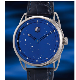
850 De Bethune A unique, symbolic and extreme... Estimate HK$400,000 — 800,000