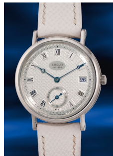
878 Breguet A fine white gold wristwatch wit... Estimate HK$50,000 — 80,000