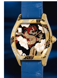
959 Cartier A rare and exotic limited edition ... Estimate HK$155,000 — 310,000