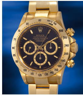
1022 Rolex A rare, well-preserved and attra... Estimate HK$170,000 — 350,000