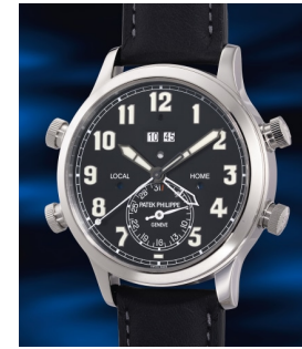
1054 Patek Philippe A "like-new", highly rare and tec... Estimate HK$950,000 — 1,500,000