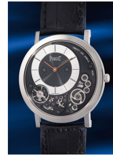
944 Piaget A unique, very fine and "like-ne... Estimate HK$80,000 — 160,000