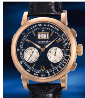
888 A. Lange & Söhne A rare and elegant pink gold fly... Estimate HK$500,000 — 700,000