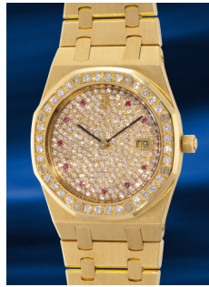
922 Audemars Piguet A rare, well-preserved and attra... Estimate HK$120,000 — 240,000