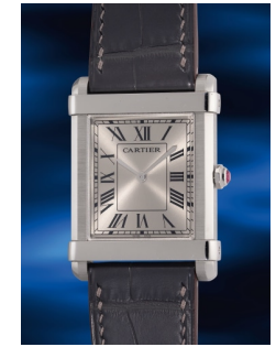
925 Cartier A rare and elegant limited editio... Estimate HK$120,000 — 200,000