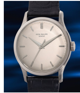
1034 Patek Philippe A rare and well-preserved white ... Estimate HK$100,000 — 150,000