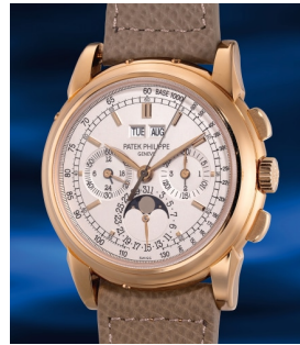
858 Patek Philippe A rare, elegant and attractive pi... Estimate HK$700,000 — 1,100,000