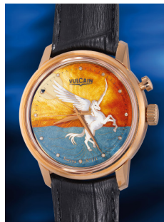
947 Vulcain A unique, elegant and "like-new... Estimate HK$80,000 — 160,000