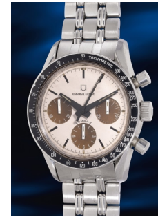
864 Universal Genève A rare and highly attractive stai... Estimate HK$100,000 — 200,000