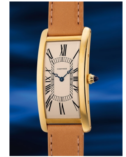
835 Cartier A highly attractive and rare limited... Estimate HK$200,000 — 400,000