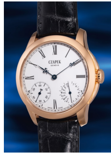
993 Czapek A fine and elegant limited editio... Estimate HK$100,000 — 200,000