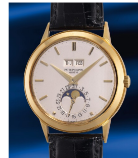
1019 Patek Philippe A very well-preserved, rare and ... Estimate HK$550,000 — 1,000,000