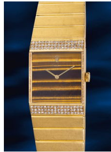
1013 Rolex An extremely attractive and rar... Estimate HK$120,000 — 230,000