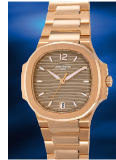
994 Patek Philippe A "like-new" and attractive pink... Estimate HK$200,000 — 400,000