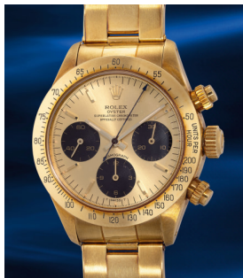
1016 Rolex An extremely attractive, rare an... Estimate HK$600,000 — 1,000,000