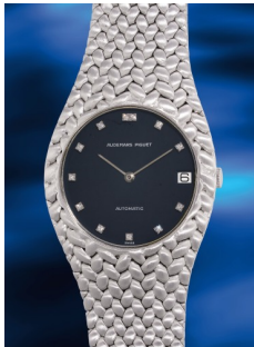
976 Audemars Piguet A rare and well-preserved white ... Estimate HK$160,000 — 240,000