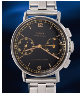
863 Rolex A possibly unpolished, very rare ... Estimate HK$380,000 — 620,000