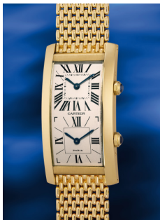
836 Cartier A highly rare and attractive yellow... Estimate HK$150,000 — 300,000