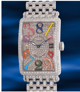
1051 Franck Muller An eccentric and extravagant w... Estimate HK$190,000 — 250,000

Hong Kong Auction / 23 May 2025 / 6:30pm HKT