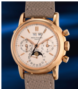
1046 Patek Philippe A very fine and rare pink gold pe... Estimate HK$640,000 — 1,280,000