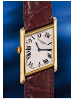
833 Cartier An extremely rare and commem... Estimate HK$120,000 — 200,000