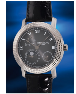
1055 Patek Philippe A rare and fine limited edition w... Estimate HK$120,000 — 240,000