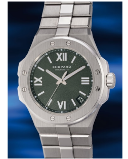
820 Chopard A "like-new" and highly attracti... Estimate HK$55,000 — 110,000