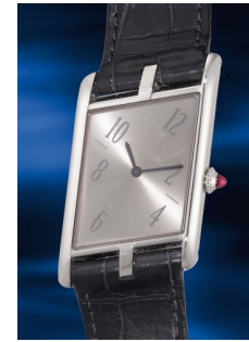
924 Cartier A rare and attractive limited edi... Estimate HK$160,000 — 240,000