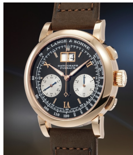
208 A. Lange & Söhne A rare and elegant pink gold fly... Estimate 30,000 — 60,000 CHF