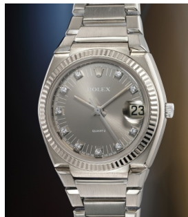
168 Rolex A heavy, impressive and possibl... Estimate 35,000 — 70,000 CHF