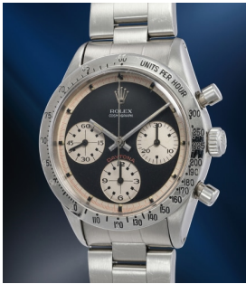
196 Rolex An early, attractive and collectib... Estimate 100,000 — 200,000 CHF