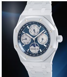
177 Audemars Piguet A cutting-edge white ceramic p... Estimate 150,000 — 300,000 CHF