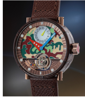
132 Alain Silberstein A very rare, unusual and eccentr... Estimate 20,000 — 40,000 CHF