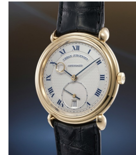
139 Urban Jürgensen An extremely well-preserved, ra... Estimate 10,000 — 20,000 CHF