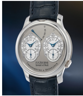
22 F.P. Journe An ingenious and highly sought ... Estimate 140,000 — 280,000 CHF