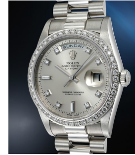
34 Rolex A highly rare and attractive plat... Estimate 25,000 — 50,000 CHF