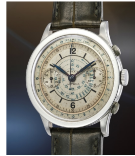
164 Rolex A large, charming and extremel... Estimate 70,000 — 140,000 CHF