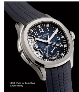
149 Patek Philippe A highly sought after and innov... Estimate 300,000 — 600,000 CHF