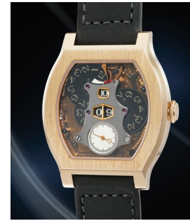
24 F.P. Journe A very attractive pink gold jump... Estimate 120,000 — 240,000 CHF