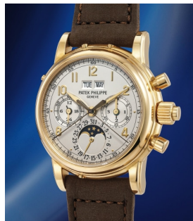
187 Patek Philippe An enticing and rare yellow gold... Estimate 120,000 — 240,000 CHF