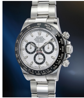
2 Rolex A highly desirable and sporty st... Estimate 15,000 — 25,000 CHF