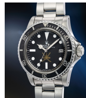
110 Rolex A very rare, well preserved and ... Estimate 250,000 — 500,000 CHF