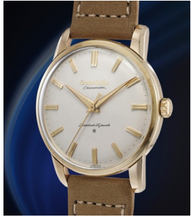
31 Grand Seiko An early, fine and collectible gol... Estimate 5,000 — 10,000 CHF

Geneva Auction / 5 November 2022 / 2pm CET