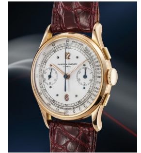
200 Vacheron Constantin An elegant pink gold chronogra... Estimate 15,000 — 25,000 CHF