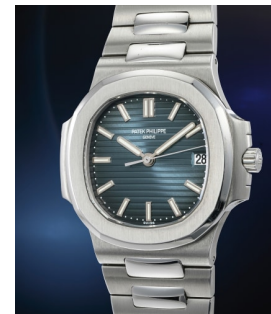
179 Patek Philippe A rare and attractive stainless-s... Estimate 70,000 — 140,000 CHF