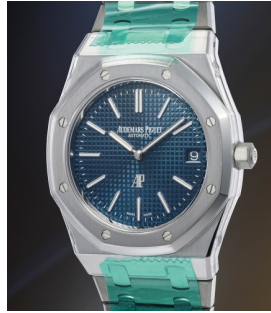
83 Audemars Piguet A brand new, never worn stainle... Estimate 40,000 — 80,000 CHF