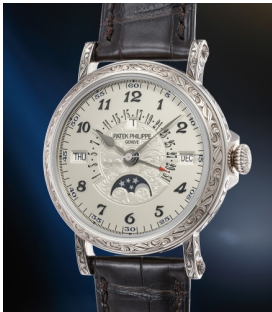
86 Patek Philippe A very fine and uncommon whit... Estimate 70,000 — 140,000 CHF