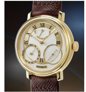
30 George Daniels An extremely rare, historically i... Estimate 300,000 — 600,000 CHF