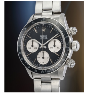
195 Rolex A highly attractive and well-pre... Estimate 50,000 — 100,000 CHF