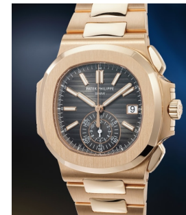
189 Patek Philippe A rare, hefty, and extremely sou... Estimate 150,000 — 300,000 CHF