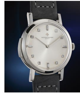
204 Vacheron Constantin A supremely elegant, scarce an... Estimate 100,000 — 200,000 CHF