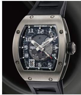
123 Richard Mille A very rare and attractive semi s... Estimate 30,000 — 60,000 CHF