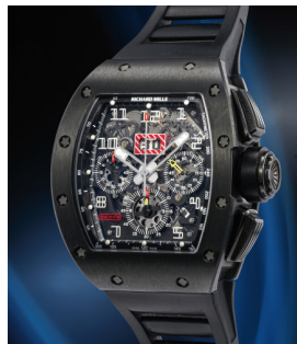
188 Richard Mille A very fine and rare black-coate... Estimate 90,000 — 180,000 CHF