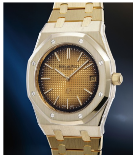
8 Audemars Piguet A new and flamboyant yellow g... Estimate 50,000 — 100,000 CHF