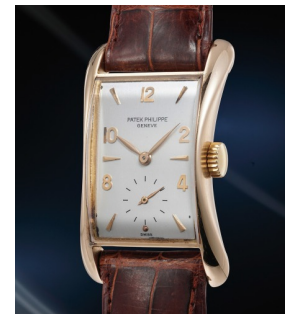
150 Patek Philippe An exquisite, charming and high... Estimate 20,000 — 40,000 CHF