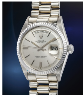
217 Rolex A rare and well-preserved white ... Estimate 15,000 — 30,000 CHF