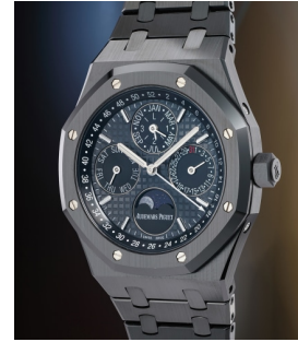
224 Audemars Piguet An attractive and extremely sou... Estimate 180,000 — 360,000 CHF