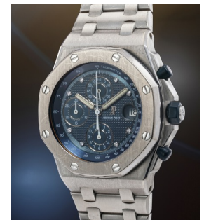
10 Audemars Piguet A rare, fine and attractive white ... Estimate 50,000 — 100,000 CHF