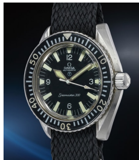
127 Omega A rare and attractive stainless s... Estimate 30,000 — 50,000 CHF