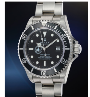
130 Rolex A "new-old-stock", highly impor... Estimate 150,000 — 300,000 CHF