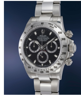
118 Rolex A highly rare and attractive stai... Estimate 15,000 — 25,000 CHF