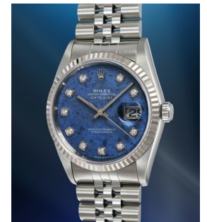
190 Rolex An impressively well-preserved ... Estimate 8,000 — 12,000 CHF