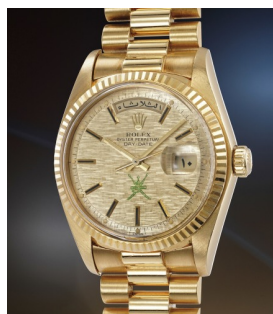
108 Rolex A rare and attractive yellow gol... Estimate 25,000 — 50,000 CHF