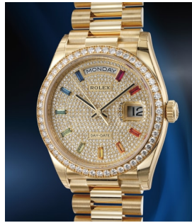
173 Rolex A rare and like-new yellow gold,... Estimate 30,000 — 50,000 CHF