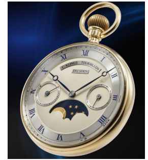
25 Christian Klings An impressive and unique self-s... Estimate 60,000 — 120,000 CHF