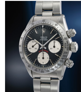
39 Rolex A rare and impressively well-pre... Estimate 60,000 — 100,000 CHF