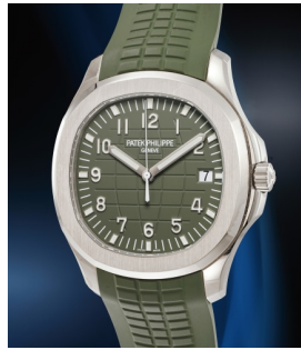
3 Patek Philippe A sporty and elegant white gold ... Estimate 60,000 — 120,000 CHF