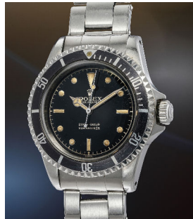
37 Rolex An impressive and incredibly we... Estimate 40,000 — 80,000 CHF