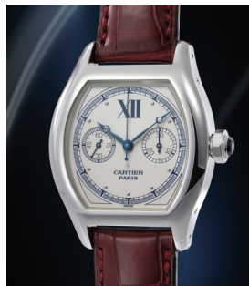
218 Cartier A highly rare and attractive whit... Estimate 20,000 — 40,000 CHF