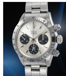
109 Rolex A superbly well preserved and r... Estimate 150,000 — 300,000 CHF