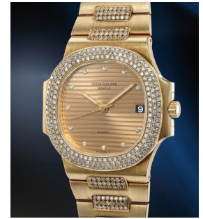
175 Patek Philippe A rare and charming yellow gold... Estimate 80,000 — 160,000 CHF