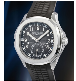
119 Patek Philippe A fine and attractive stainless st... Estimate 40,000 — 80,000 CHF