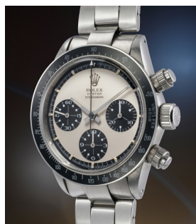
106 Rolex A fine, rare, and highly attractiv... Estimate 250,000 — 500,000 CHF