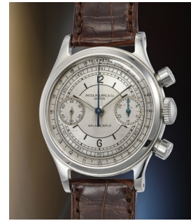
114 Patek Philippe An astoundingly attractive, extr... Estimate 300,000 — 600,000 CHF