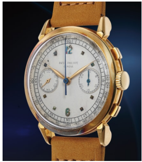
211 Patek Philippe A large, charismatic and very co... Estimate 25,000 — 50,000 CHF

Geneva Auction / 5 November 2022 / 2pm CET