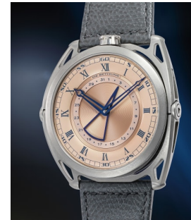
89 De Bethune An incredibly charismatic and ra... Estimate 30,000 — 50,000 CHF