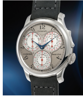
133 F.P. Journe An attractive and technically im... Estimate 80,000 — 160,000 CHF