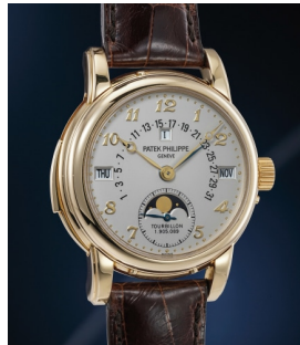
88 Patek Philippe A superlative, extremely rare an... Estimate 250,000 — 500,000 CHF