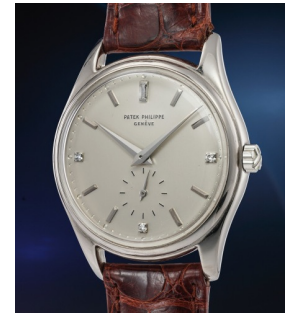
205 Patek Philippe An extraordinary and very impo... Estimate 100,000 — 200,000 CHF