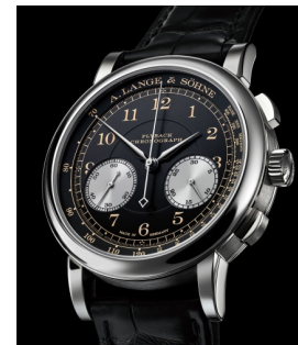
209 A. Lange & Söhne A unique white gold flyback chr... Estimate 100,000 — 200,000 CHF