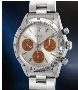
197 Rolex A surprising and highly collectibl... Estimate 80,000 — 160,000 CHF