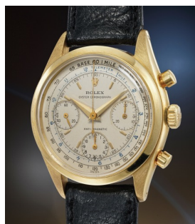
157 Rolex An impressively well-preserved ... Estimate 60,000 — 120,000 CHF