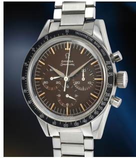
202 Omega An extremely well-preserved, ea... Estimate 30,000 — 60,000 CHF