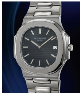
148 Patek Philippe A game changing, rare and attr... Estimate 70,000 — 140,000 CHF