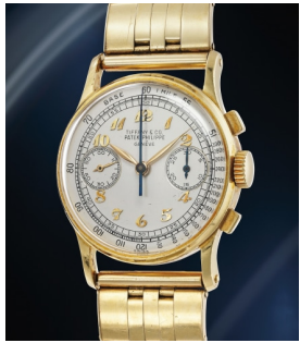
111 Patek Philippe An extremely uncommon and hi... Estimate 50,000 — 100,000 CHF

Geneva Auction / 5 November 2022 / 2pm CET