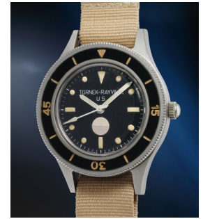
125 Tornek-Rayville An extremely rare and historical... Estimate 60,000 — 120,000 CHF