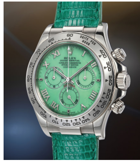
172 Rolex A rare and attractive white gold ... Estimate 20,000 — 40,000 CHF