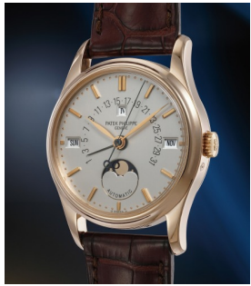
121 Patek Philippe An elegant, rare and attractive ... Estimate 35,000 — 70,000 CHF

Geneva Auction / 5 November 2022 / 2pm CET