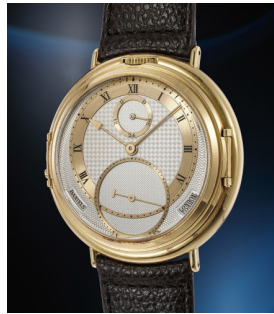
27 George Daniels A unique, historically important ... Estimate 1,000,000 — 0 CHF