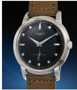
203 Patek Philippe A possibly unique, superbly eleg... Estimate 150,000 — 300,000 CHF