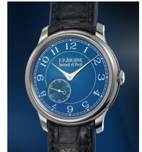
90 F.P. Journe A very elegant and eye-catching... Estimate 30,000 — 60,000 CHF