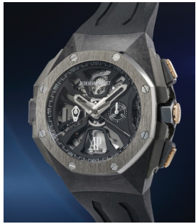
181 Audemars Piguet An extremely fine and rare cera... Estimate 75,000 — 150,000 CHF

Geneva Auction / 5 November 2022 / 2pm CET