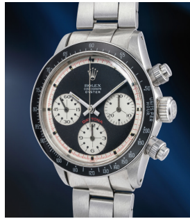
162 Rolex A highly rare and attractive stai... Estimate 400,000 — 800,000 CHF