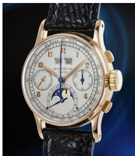
153 Patek Philippe A very uncommon, extremely co... Estimate 800,000 — 1,600,000 CHF