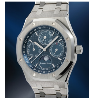
180 Audemars Piguet A very attractive and rare stainl... Estimate 80,000 — 160,000 CHF