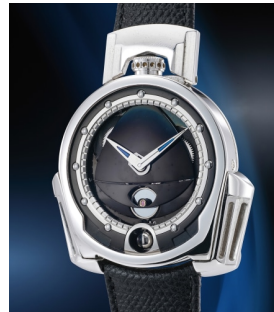
137 De Bethune A unique, cutting edge platinum... Estimate 80,000 — 160,000 CHF