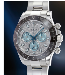
129 Rolex A heavy and impressive platinu... Estimate 120,000 — 200,000 CHF