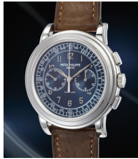
112 Patek Philippe An attractive platinum chronogr... Estimate 200,000 — 400,000 CHF