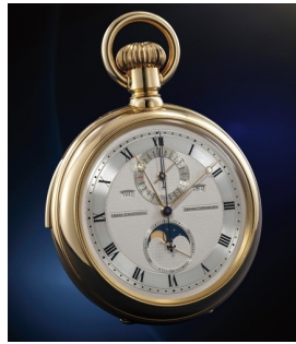
143 Derek Pratt for Urban ... An extremely rare, refined, com... Estimate 80,000 — 160,000 CHF