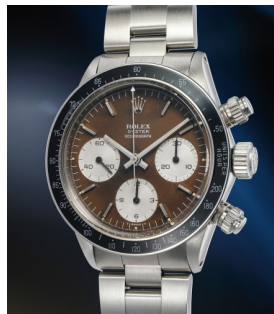
167 Rolex An early, very well-preserved an... Estimate 80,000 — 160,000 CHF