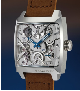
221 TAG Heuer A very original platinum wristw... Estimate 20,000 — 40,000 CHF

Geneva Auction / 5 November 2022 / 2pm CET