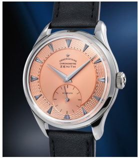
21 Zenith X Voutilainen ... A unique niobium wristwatch wi... Estimate 100,000 — 200,000 CHF

Geneva Auction / 5 November 2022 / 2pm CET