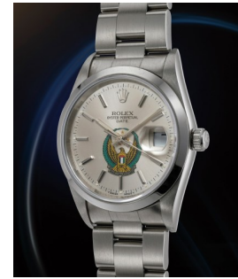
194 Rolex An extremely rare and virtually "... Estimate 2,000 — 4,000 CHF