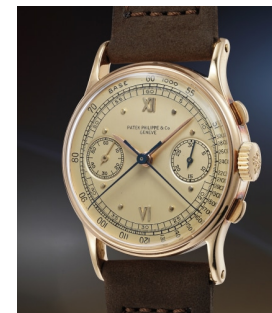
155 Patek Philippe A so far unique, early, extremely... Estimate 200,000 — 400,000 CHF