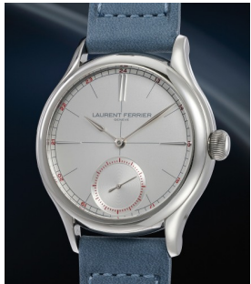
226 Laurent Ferrier A rare, fine and attractive titani... Estimate 25,000 — 50,000 CHF