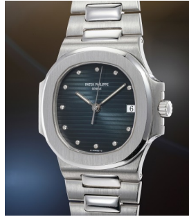
223 Patek Philippe A highly rare and heavy platinu... Estimate 70,000 — 140,000 CHF