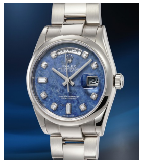
216 Rolex A highly rare white gold and dia... Estimate 15,000 — 30,000 CHF