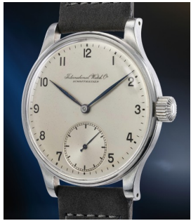
201 IWC A fine, rare, and very large stain... Estimate 15,000 — 30,000 CHF

Geneva Auction / 5 November 2022 / 2pm CET