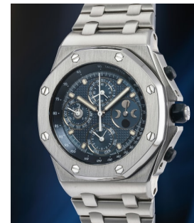
219 Audemars Piguet A massive, impressive and highl... Estimate 50,000 — 100,000 CHF