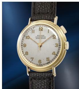
101 Rolex A potentially unique and extrem... Estimate 25,000 — 50,000 CHF

Geneva Auction / 5 November 2022 / 2pm CET