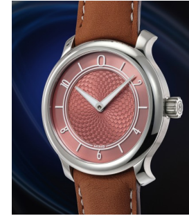
134 Ming A very attractive stainless steel ... Estimate 2,000 — 4,000 CHF