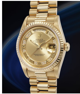
193 Rolex A rare and attractive yellow gol... Estimate 12,000 — 14,000 CHF