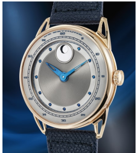
136 De Bethune A unique and cutting edge pink ... Estimate 40,000 — 80,000 CHF