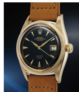
159 Rolex An exceedingly rare and well-pr... Estimate 20,000 — 40,000 CHF