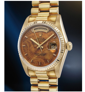
185 Rolex An incredibly well-preserved yell... Estimate 20,000 — 40,000 CHF