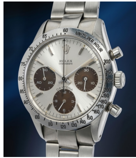
163 Rolex An attractive stainless steel chr... Estimate 50,000 — 100,000 CHF