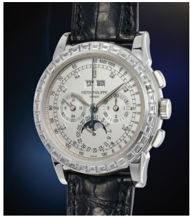
171 Patek Philippe A rare and possibly unique plati... Estimate 180,000 — 360,000 CHF

Geneva Auction / 5 November 2022 / 2pm CET