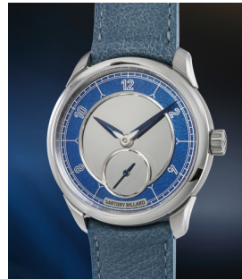
138 Sartory Billard A very elegant custom made sta... Estimate 3,000 — 6,000 CHF