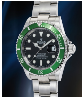
117 Rolex This lot is no longer available. Estimate 15,000 — 30,000 CHF