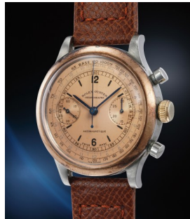
38 Rolex A charming and well-preserved ... Estimate 30,000 — 60,000 CHF