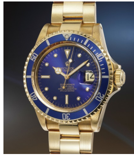
192 Rolex A highly rare and incredibly well... Estimate 30,000 — 60,000 CHF