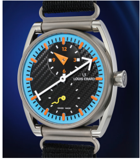
131 Louis Erard X Alain Si... A playful and unusual titanium ... Estimate 2,000 — 4,000 CHF

Geneva Auction / 5 November 2022 / 2pm CET