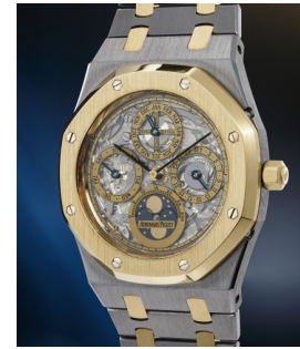
124 Audemars Piguet An extremely rare tantalum and... Estimate 100,000 — 200,000 CHF