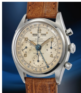
103 Rolex A supremely rare and highly co... Estimate 150,000 — 300,000 CHF