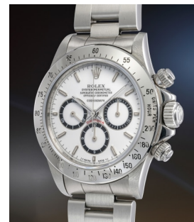
104 Rolex A highly rare and attractive stai... Estimate 60,000 — 120,000 CHF