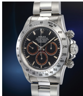
128 Rolex An unpolished, extremely well-p... Estimate 35,000 — 70,000 CHF