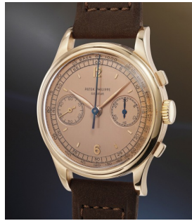
113 Patek Philippe An extremely uncommon, attra... Estimate 300,000 — 600,000 CHF