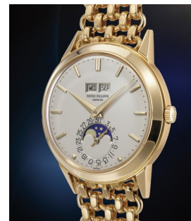
154 Patek Philippe A rare, unusual and most proba... Estimate 100,000 — 200,000 CHF