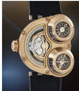
228 MB&F An astounding pink gold three-... Estimate 30,000 — 60,000 CHF