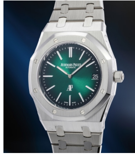
222 Audemars Piguet An exceptional, desirable and n... Estimate 100,000 — 200,000 CHF