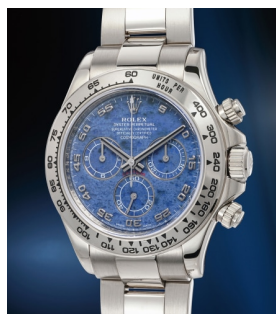
156 Rolex An attractive and elegant white ... Estimate 40,000 — 80,000 CHF