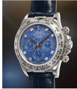
33 Rolex A highly rare and attractive whit... Estimate 20,000 — 40,000 CHF