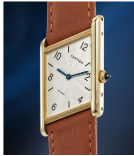
183 Cartier A highly rare, surprising and att... Estimate 30,000 — 60,000 CHF