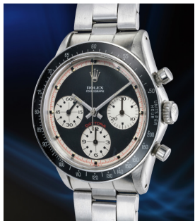
176 Rolex A well preserved, rare and attra... Estimate 150,000 — 300,000 CHF