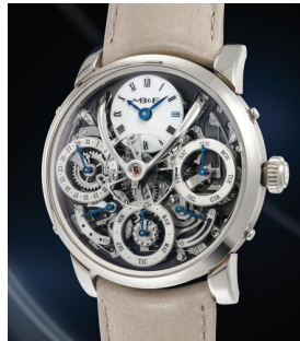
227 MB&F An exceptional and cutting edge... Estimate 60,000 — 120,000 CHF