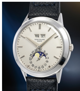
152 Patek Philippe A very rare and well-preserved ... Estimate 400,000 — 800,000 CHF