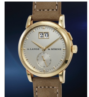
210 A. Lange & Söhne An early, rare and attractive yell... Estimate 10,000 — 20,000 CHF