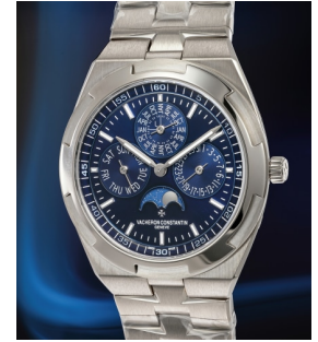
85 Vacheron Constantin An incredibly attractive ultra sli... Estimate 70,000 — 140,000 CHF