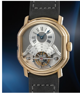
28 Daniel Roth A wonderful and rare pink gold ... Estimate 30,000 — 60,000 CHF