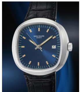
166 Patek Philippe A rare, fine, and oversized white... Estimate 20,000 — 40,000 CHF