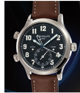
4 Patek Philippe A sporty and attractive white go... Estimate 20,000 — 40,000 CHF