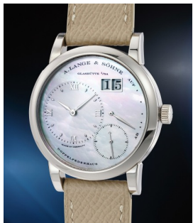
206 A. Lange & Söhne A very elegant and distinguishe... Estimate 15,000 — 30,000 CHF