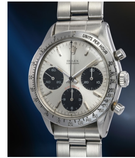
174 Rolex An uncommon and attractive st... Estimate 60,000 — 120,000 CHF