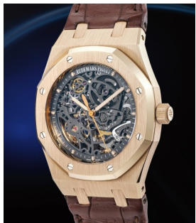
146 Audemars Piguet An extremely attractive pink gol... Estimate 70,000 — 140,000 CHF