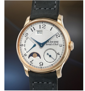
135 F.P. Journe An exquisite and distinguished ... Estimate 40,000 — 80,000 CHF