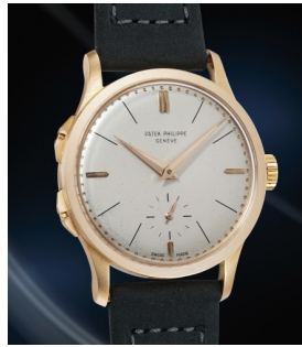
212 Patek Philippe A superbly well-preserved, very ... Estimate 120,000 — 250,000 CHF