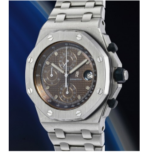
35 Audemars Piguet A rare and attractive stainless s... Estimate 25,000 — 50,000 CHF