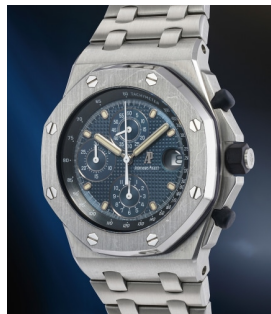
178 Audemars Piguet A very early, uncommon and col... Estimate 50,000 — 100,000 CHF