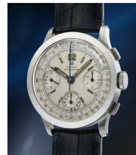
105 Rolex An extremely rare, fascinating a... Estimate 150,000 — 300,000 CHF