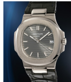
169 Patek Philippe A fine and rare white gold wrist... Estimate 35,000 — 70,000 CHF