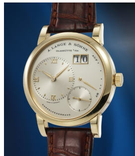
207 A. Lange & Söhne A highly rare, early and attractiv... Estimate 10,000 — 20,000 CHF