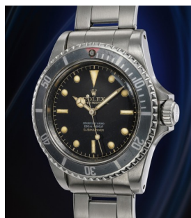
107 Rolex An extremely rare, highly impor... Estimate 100,000 — 200,000 CHF