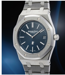
122 Audemars Piguet A rare and attractive stainless s... Estimate 40,000 — 80,000 CHF