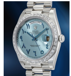
220 Rolex A very rare and highly attractive... Estimate 100,000 — 200,000 CHF