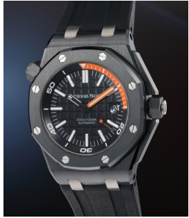
81 Audemars Piguet A fine and attractive ceramic wr... Estimate 15,000 — 30,000 CHF

Geneva Auction / 5 November 2022 / 2pm CET