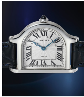
182 Cartier A unique and special order cloch... Estimate 30,000 — 60,000 CHF