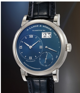
6 A. Lange & Söhne An elegant and fine white gold ... Estimate 20,000 — 40,000 CHF