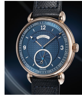
29 Voutilainen A unique, incredible attractive p... Estimate 70,000 — 140,000 CHF