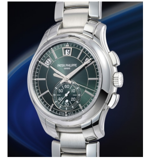
5 Patek Philippe A rare and attractive stainless s... Estimate 40,000 — 80,000 CHF