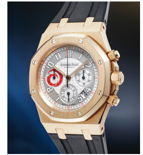
145 Audemars Piguet A fine and attractive pink gold c... Estimate 30,000 — 60,000 CHF