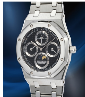
147 Audemars Piguet An outstanding, massive and ex... Estimate 80,000 — 160,000 CHF