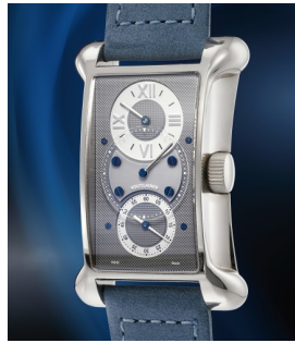
23 Voutilainen An exceedingly rare and import... Estimate 50,000 — 100,000 CHF