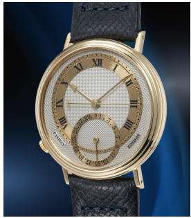
141 George Daniels A superb and ultimate yellow go... Estimate 250,000 — 500,000 CHF

Geneva Auction / 5 November 2022 / 2pm CET