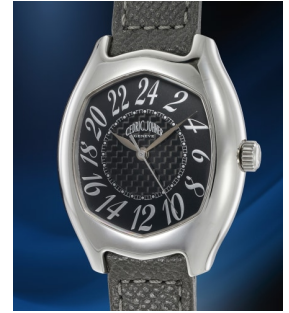
225 Cedric Johner An unusual and rare stainless st... Estimate 2,000 — 4,000 CHF