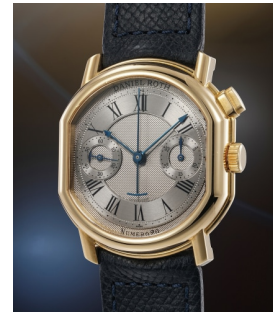
229 Daniel Roth A sumptuous yellow gold mono... Estimate 20,000 — 40,000 CHF