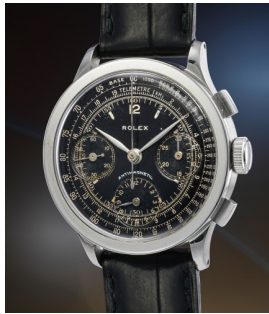
198 Rolex A large very rare and attractive ... Estimate 150,000 — 300,000 CHF