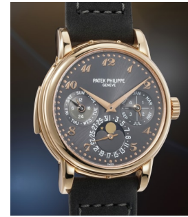
214 Patek Philippe A so far unique, early, extremely... Estimate 300,000 — 600,000 CHF