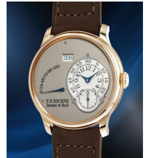
230 F.P. Journe A rare, early and attractive pink ... Estimate 70,000 — 140,000 CHF