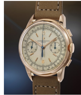
199 Vacheron Constantin An incredibly rare pink gold chro... Estimate 30,000 — 60,000 CHF