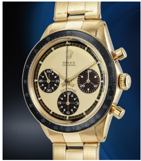
161 Rolex An extraordinarily rare, extreme... Estimate 550,000 — 1,100,000 CHF

Geneva Auction / 5 November 2022 / 2pm CET