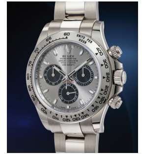
115 Rolex A rare, sporty and attractive whi... Estimate 25,000 — 50,000 CHF