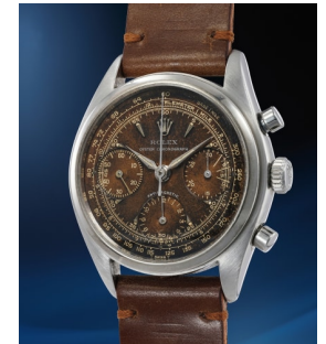
40 Rolex A fascinating and highly collecti... Estimate 120,000 — 240,000 CHF