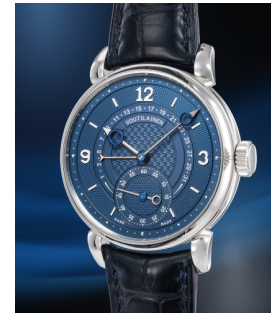
144 Voutilainen A superbly executed platinum w... Estimate 80,000 — 160,000 CHF