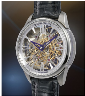
26 Vianney Halter A unique titanium double balan... Estimate 100,000 — 200,000 CHF