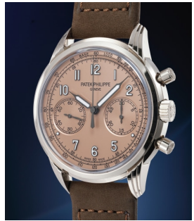
116 Patek Philippe A rare and attractive white gold ... Estimate 40,000 — 60,000 CHF