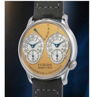
140 F.P. Journe A technically impressive, rare an... Estimate 180,000 — 360,000 CHF