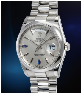
191 Rolex A rare, very fine and elegant pla... Estimate 15,000 — 25,000 CHF

Geneva Auction / 5 November 2022 / 2pm CET