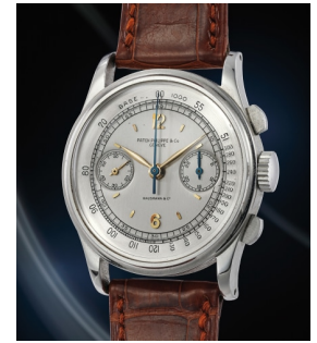
215 Patek Philippe An incredibly rare and importan... Estimate 500,000 — 1,000,000 CHF