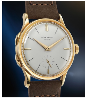
213 Patek Philippe A very elegant and extremely co... Estimate 40,000 — 80,000 CHF