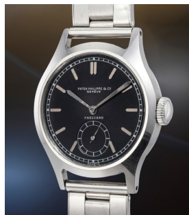
151 Patek Philippe An incredibly rare and well-pres... Estimate 100,000 — 200,000 CHF

Geneva Auction / 5 November 2022 / 2pm CET