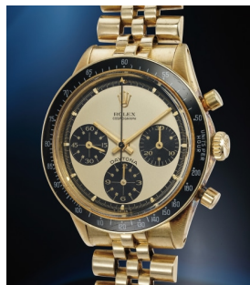
102 Rolex A highly attractive, beautifully p... Estimate 400,000 — 800,000 CHF