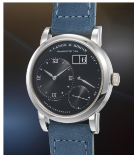
7 A. Lange & Söhne A rare and attractive platinum ... Estimate 25,000 — 50,000 CHF