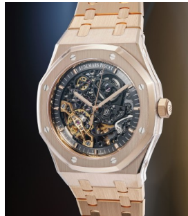
87 Audemars Piguet An impressive and exclusive pin... Estimate 90,000 — 180,000 CHF