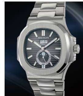
9 Patek Philippe A rare and attractive stainless s... Estimate 35,000 — 70,000 CHF