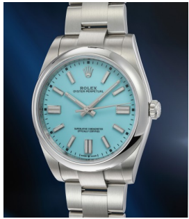
1 Rolex A fine, attractive and sought-after... Estimate 5,000 — 10,000 CHF