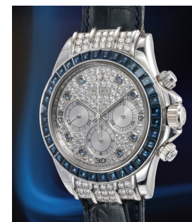
160 Rolex An impressive, exquisite and ext... Estimate 100,000 — 200,000 CHF