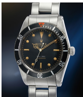
158 Rolex An impressive and extremely we... Estimate 50,000 — 100,000 CHF