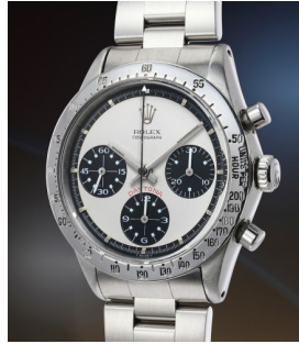
82 Rolex An iconic, collectible and highly ... Estimate 120,000 — 240,000 CHF