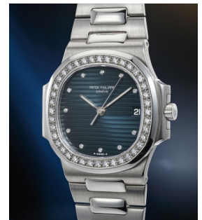
170 Patek Philippe A highly rare and attractive plat... Estimate 80,000 — 160,000 CHF