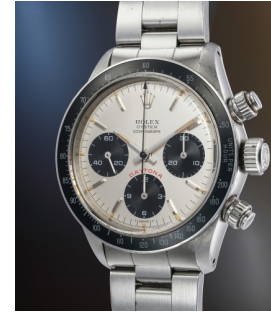
84 Rolex A highly rare and attractive stai... Estimate 50,000 — 100,000 CHF