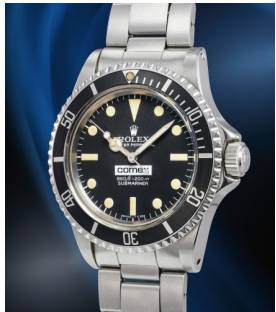
36 Rolex A superb, sought-after, and hig... Estimate 60,000 — 120,000 CHF