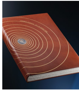
142 George Daniels A leather bound autobiography ... Estimate 1,000 — 2,000 CHF