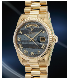
186 Rolex A rare and attractive yellow gol... Estimate 15,000 — 30,000 CHF