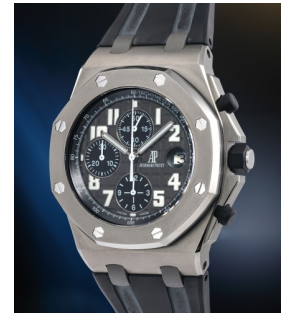
165 Audemars Piguet A highly rare and attractive tita... Estimate 12,000 — 18,000 CHF