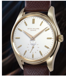
160 Patek Philippe An extremely well-preserved an... Estimate 40,000 — 80,000 CHF