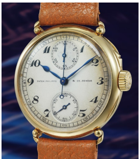
94 Patek Philippe An ultra rare, historically import... Estimate 250,000 — 500,000 CHF