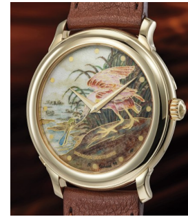
142 Vacheron Constantin A wonderfully attractive yellow ... Estimate 25,000 — 50,000 CHF