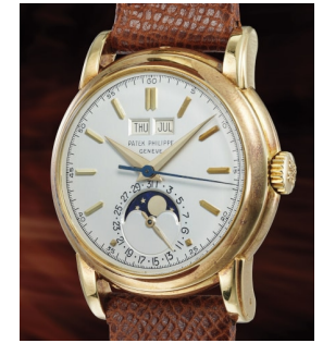
93 Patek Philippe A supremely scarce, highly colle... Estimate 250,000 — 500,000 CHF