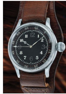
151 Seikoshu A very rare, historically intriguin... Estimate 10,000 — 15,000 CHF