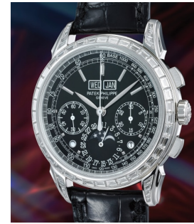
82 Patek Philippe A freshly unsealed and rare plati... Estimate 130,000 — 260,000 CHF