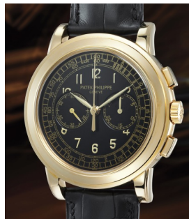
126 Patek Philippe A fine, attractive and rare yello... Estimate 30,000 — 60,000 CHF