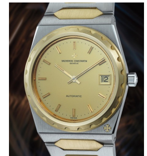
58 Vacheron Constantin A very rare and attractive yello... Estimate 25,000 — 50,000 CHF