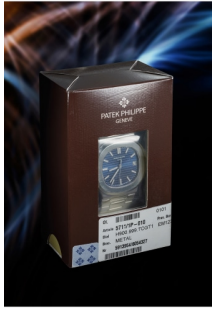
119 Patek Philippe An important and rare platinum... Estimate 350,000 — 500,000 CHF

Geneva Auction / 3 November 2023 / 2pm CET