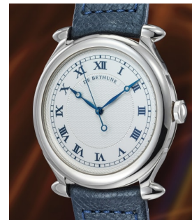
37 De Bethune A rare and early white gold wrist... Estimate 15,000 — 30,000 CHF