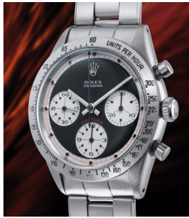
179 Rolex A highly rare, exceptionally well... Estimate 150,000 — 300,000 CHF

Geneva Auction / 3 November 2023 / 2pm CET