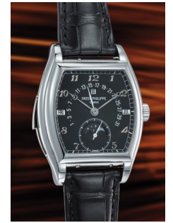
33 Patek Philippe An extremely attractive and rar... Estimate 250,000 — 500,000 CHF