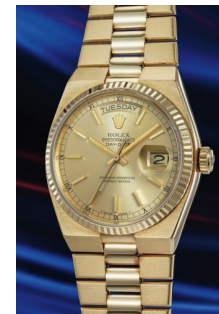
127 Rolex A rare and attractive yellow gol... Estimate 10,000 — 20,000 CHF