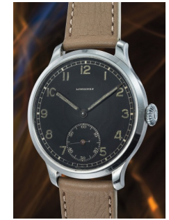
83 Longines A charming, uncommon and ov... Estimate 10,000 — 15,000 CHF