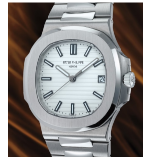
28 Patek Philippe A rare stainless steel wristwatch... Estimate 40,000 — 80,000 CHF