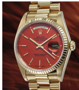
125 Rolex A highly rare and attractive yell... Estimate 30,000 — 60,000 CHF