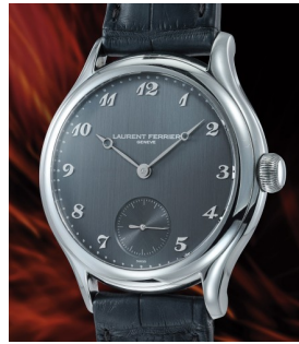
150 Laurent Ferrier An extremely scarce and highly ... Estimate 25,000 — 50,000 CHF