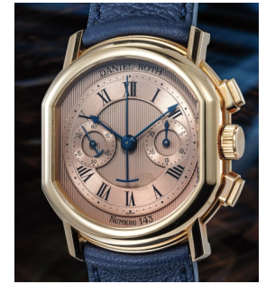
143 Daniel Roth A gorgeous, attractive and early... Estimate 25,000 — 50,000 CHF