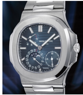
100 Patek Philippe An extremely rare stainless stee... Estimate 70,000 — 140,000 CHF