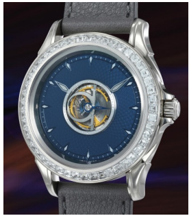
29 Omega A highly rare and attractive whit... Estimate 40,000 — 80,000 CHF

Geneva Auction / 3 November 2023 / 2pm CET