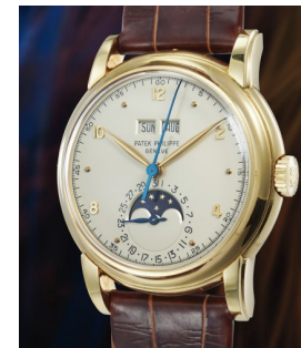
117 Patek Philippe A stunning and rare yellow gold ... Estimate 200,000 — 400,000 CHF