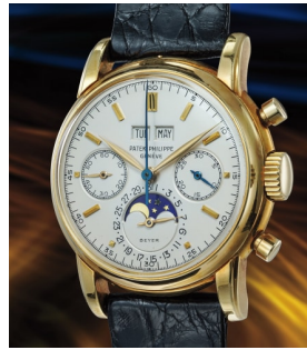
11 Patek Philippe A supremely rare, well-preserve... Estimate 400,000 — 800,000 CHF