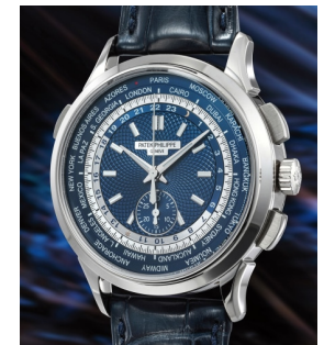
98 Patek Philippe A rare and attractive white gold ... Estimate 30,000 — 60,000 CHF