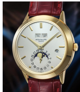
116 Patek Philippe An extremely scarce, highly coll... Estimate 150,000 — 300,000 CHF