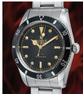
35 Rolex An extremely rare and early stai... Estimate 80,000 — 160,000 CHF