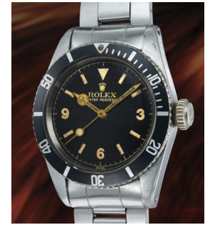
183 Rolex An extremely elusive and collect... Estimate 250,000 — 500,000 CHF