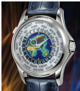
124 Patek Philippe A freshly unsealed and attractiv... Estimate 70,000 — 140,000 CHF