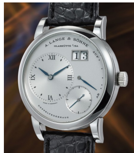
45 A. Lange & Söhne An extremely rare and importan... Estimate 100,000 — 200,000 CHF