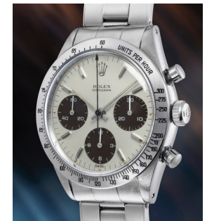
178 Rolex An early and well-preserved stai... Estimate 100,000 — 200,000 CHF