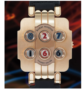
43 Harry Winston and Vi... A game changing and cutting e... Estimate 80,000 — 160,000 CHF