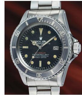
187 Rolex An extremely rare and historical... Estimate 350,000 — 700,000 CHF