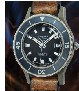
157 Blancpain An awe-inspiring, supremely elu... Estimate 35,000 — 70,000 CHF