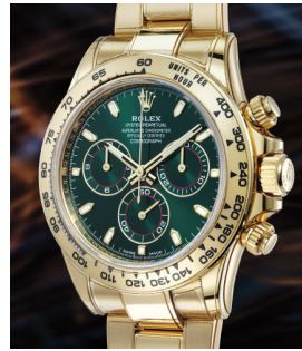
3 Rolex A rare and attractive yellow gol... Estimate 40,000 — 80,000 CHF