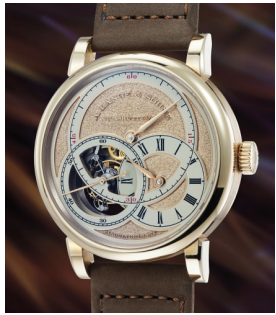
139 A. Lange & Söhne A very fine, impressive and rare ... Estimate 150,000 — 300,000 CHF

Geneva Auction / 3 November 2023 / 2pm CET