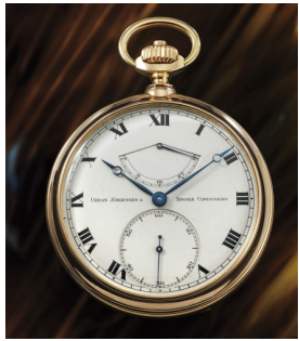
109 Derek Pratt for Urban ... A superbly crafted, rare and imp... Estimate 120,000 — 240,000 CHF

Geneva Auction / 3 November 2023 / 2pm CET