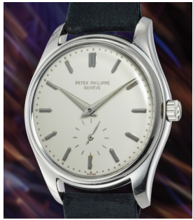
10 Patek Philippe An extremely scarce, important ... Estimate 100,000 — 200,000 CHF

Geneva Auction / 3 November 2023 / 2pm CET