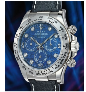
133 Rolex A rare and highly attractive whit... Estimate 25,000 — 50,000 CHF