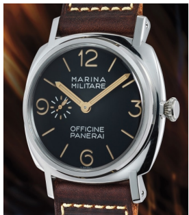
24 Panerai An important and unique platin... Estimate 60,000 — 180,000 CHF