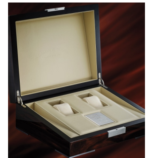
48 A. Lange & Söhne A rare, heavy and attractive wo... Estimate 1,000 — 2,000 CHF