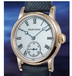
108 Philippe Dufour The only known and historically ... Estimate 400,000 — 800,000 CHF