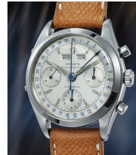
87 Rolex A very fine, rare and incredibly ... Estimate 250,000 — 500,000 CHF