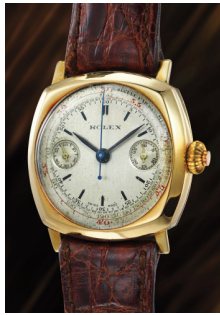
170 Rolex A fascinating and unusual singl... Estimate 10,000 — 20,000 CHF