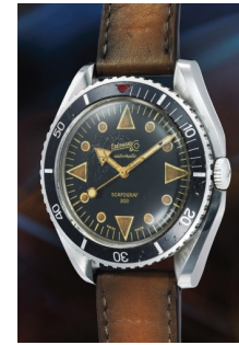
152 Eberhard A rare and highly attractive stai... Estimate 7,000 — 14,000 CHF