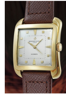
162 Vacheron Constantin A fine, large and unusual square... Estimate 15,000 — 30,000 CHF