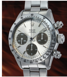
180 Rolex A rare and attractive stainless s... Estimate 70,000 — 140,000 CHF