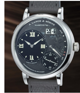
137 A. Lange & Söhne A highly uncommon and unusua... Estimate 70,000 — 140,000 CHF