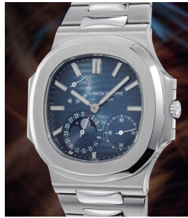
181 Patek Philippe A fine and very rare stainless ste... Estimate 70,000 — 140,000 CHF