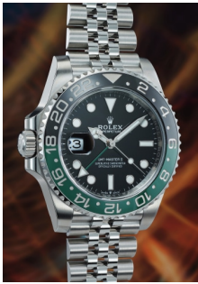
1 Rolex An extremely sought-after left... Estimate 12,000 — 24,000 CHF