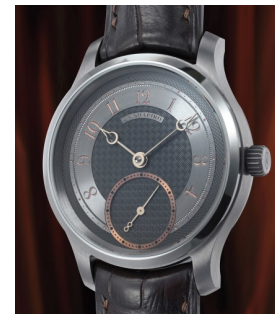
107 Shapiro A fine and very attractive tantal... Estimate 20,000 — 40,000 CHF