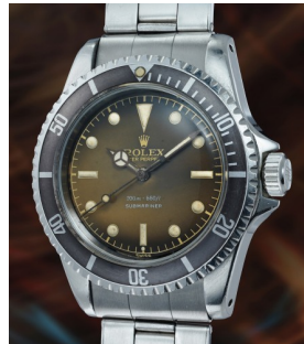
85 Rolex An exceptionally well-preserved... Estimate 30,000 — 60,000 CHF