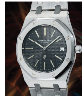
177 Audemars Piguet An extremely well-preserved sta... Estimate 70,000 — 140,000 CHF