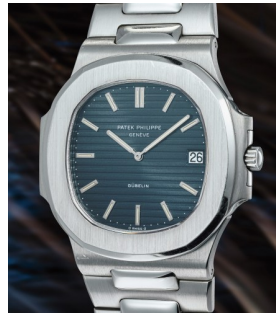
120 Patek Philippe An exceedingly important and e... Estimate 1,000,000 — 2,000,000 CHF