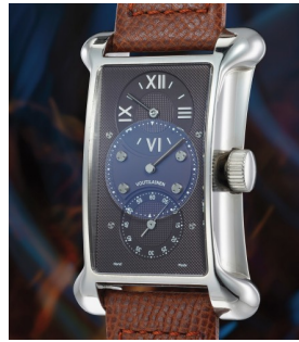
21 Kari Voutilainen A unique and important white g... Estimate 50,000 — 100,000 CHF