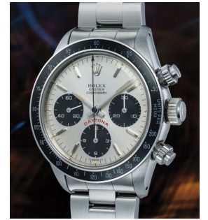
14 Rolex An extremely rare and exceptio... Estimate 100,000 — 200,000 CHF