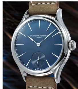
56 Laurent Ferrier An elegant white gold wristwatc... Estimate 15,000 — 25,000 CHF