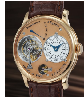
147 F.P. Journe An intriguing and visually strikin... Estimate 180,000 — 360,000 CHF