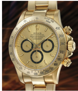
121 Rolex A rare and attractive yellow gol... Estimate 30,000 — 60,000 CHF