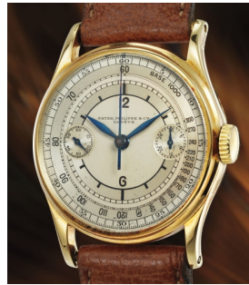
185 Patek Philippe A superb and important yellow ... Estimate 200,000 — 400,000 CHF