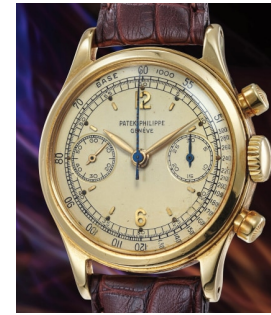
92 Patek Philippe A very rare, collectible and attra... Estimate 80,000 — 160,000 CHF