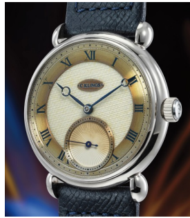
41 Christian Klings A most probably unique and wo... Estimate 50,000 — 100,000 CHF