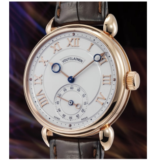
53 Kari Voutilainen A very rare and attractive pink g... Estimate 80,000 — 160,000 CHF