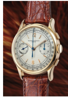
161 Vacheron Constantin An elegant pink gold chronogra... Estimate 15,000 — 30,000 CHF