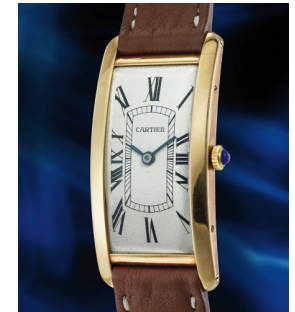
88 Cartier A rare, large and attractive curv... Estimate 20,000 — 40,000 CHF