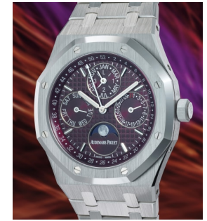
5 Audemars Piguet A striking and very scarce white ... Estimate 100,000 — 200,000 CHF