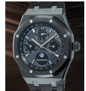
78 Audemars Piguet An attractive and extremely sou... Estimate 120,000 — 240,000 CHF