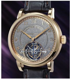
49 A. Lange & Söhne An impressive 30 piece limited e... Estimate 80,000 — 160,000 CHF

Geneva Auction / 3 November 2023 / 2pm CET