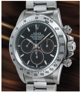
99 Rolex A practically "new-old-stock", u... Estimate 40,000 — 80,000 CHF

Geneva Auction / 3 November 2023 / 2pm CET