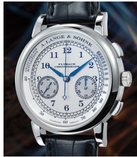
136 A. Lange & Söhne A refined and very elegant whit... Estimate 25,000 — 50,000 CHF