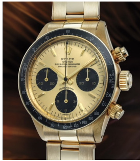
129 Rolex A scarce and luxurious yellow go... Estimate 90,000 — 180,000 CHF

Geneva Auction / 3 November 2023 / 2pm CET