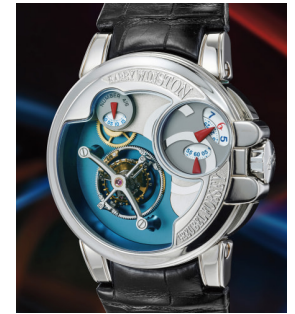
148 Harry Winston and G... A superbe and technically impre... Estimate 100,000 — 200,000 CHF