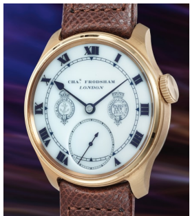
44 Charles Frodsham & Co. A stunning pink gold Double Im... Estimate 100,000 — 200,000 CHF