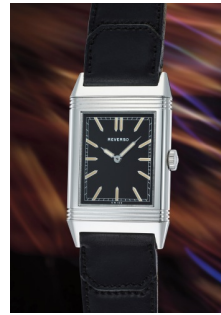
111 Jaeger-LeCoultre A rare and attractive stainless s... Estimate 7,000 — 14,000 CHF