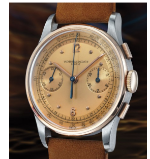
9 Vacheron Constantin A gorgeous and superbly preser... Estimate 50,000 — 100,000 CHF