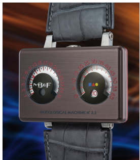
104 MB&F X Alain Silbers... A unique and unusual brown col... Estimate 25,000 — 50,000 CHF