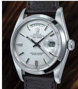
86 Rolex An extremely unusual, scarce an... Estimate 30,000 — 60,000 CHF