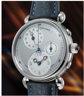
144 Kari Voutilainen A unique and superb white gold ... Estimate 120,000 — 240,000 CHF