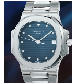
57 Patek Philippe A highly rare stainless steel wris... Estimate 30,000 — 60,000 CHF