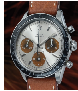
182 Rolex An extremely rare stainless stee... Estimate 70,000 — 140,000 CHF