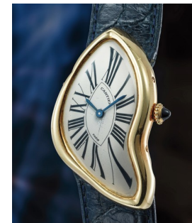
77 Cartier A very fine and rare asymmetric... Estimate 50,000 — 100,000 CHF