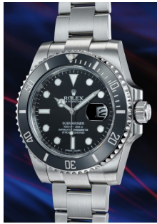
2 Rolex A fine, rare and virtually "new ol... Estimate 12,000 — 18,000 CHF