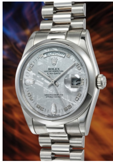
70 Rolex A highly rare and attractive whit... Estimate 18,000 — 30,000 CHF