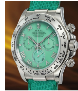
4 Rolex A rare and attractive white gold ... Estimate 30,000 — 60,000 CHF