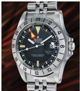
114 Rolex A rare and fine stainless steel wr... Estimate 12,000 — 24,000 CHF