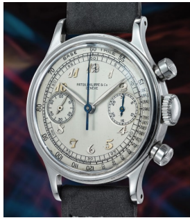
164 Patek Philippe An incredibly attractive, very rar... Estimate 300,000 — 600,000 CHF