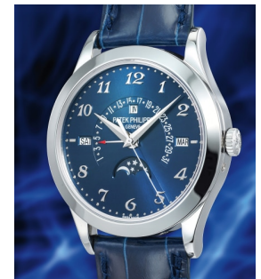
118 Patek Philippe A most probably unique platinu... Estimate 80,000 — 160,000 CHF