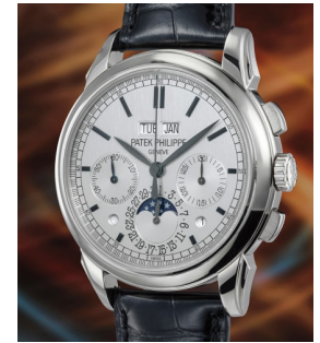
168 Patek Philippe A rare, freshly unsealed and attr... Estimate 70,000 — 140,000 CHF