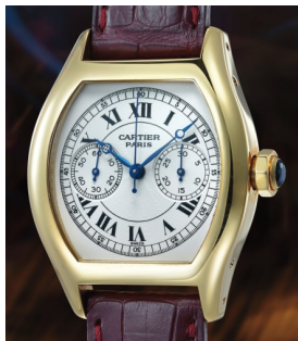
74 Cartier A highly rare and attractive yell... Estimate 20,000 — 30,000 CHF