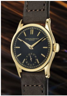
159 Patek Philippe An extremely rare and previousl... Estimate 12,000 — 24,000 CHF

Geneva Auction / 3 November 2023 / 2pm CET