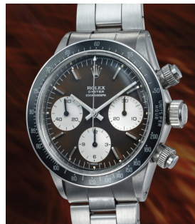
115 Rolex A rare and attractive stainless s... Estimate 100,000 — 200,000 CHF