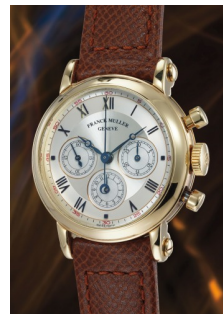
26 Franck Muller An intriguing and well-preserve... Estimate 6,000 — 12,000 CHF