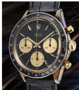
17 Rolex An extremely rare, highly sough... Estimate 180,000 — 360,000 CHF