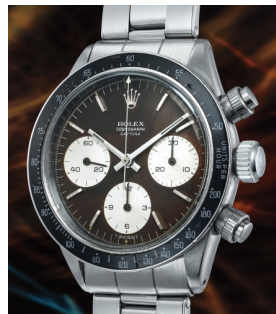
16 Rolex A highly rare and attractive stai... Estimate 80,000 — 160,000 CHF