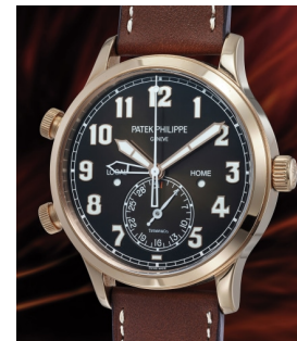
27 Patek Philippe A rare and attractive pink gold p... Estimate 30,000 — 60,000 CHF