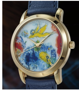
140 Vacheron Constantin A unique and extraordinary yell... Estimate 40,000 — 80,000 CHF