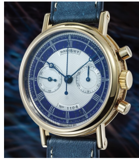
30 Breguet An enormously attractive and ra... Estimate 10,000 — 20,000 CHF