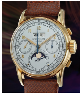
186 Patek Philippe A very important, rare and colle... Estimate 800,000 — 1,600,000 CHF