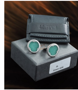
22A F.P. Journe A highly rare and attractive gree... Estimate 5,000 — 10,000 CHF