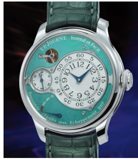
22 F.P. Journe A spectacular platinum chrono... Estimate 200,000 — 400,000 CHF