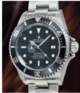
156 Rolex A fine, virtually "new-old-stock" ... Estimate 80,000 — 160,000 CHF