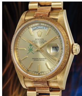
96 Rolex A very fine, well-preserved and r... Estimate 18,000 — 36,000 CHF