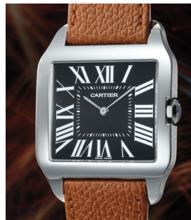
75 Cartier A very attractive special order pl... Estimate 25,000 — 50,000 CHF