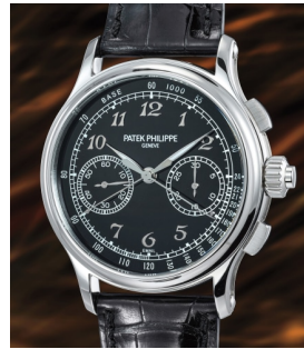
166 Patek Philippe A freshly unsealed, very attracti... Estimate 120,000 — 240,000 CHF