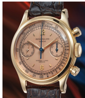
175 Patek Philippe An exceptionally attractive, rare... Estimate 250,000 — 500,000 CHF