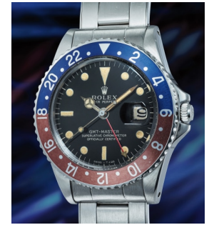
113 Rolex A highly rare and extremely attr... Estimate 20,000 — 40,000 CHF