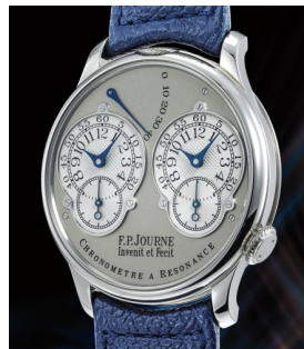
55 F.P. Journe A fine, important and rare platin... Estimate 150,000 — 300,000 CHF