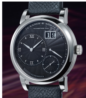
46 A. Lange & Söhne A rare and attractive limited edi... Estimate 35,000 — 40,000 CHF