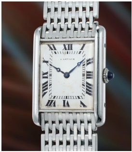
89 Cartier An attractive and rare platinum ... Estimate 50,000 — 100,000 CHF

Geneva Auction / 3 November 2023 / 2pm CET