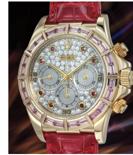
72 Rolex A very exclusive and highly attra... Estimate 80,000 — 160,000 CHF