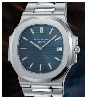
15 Patek Philippe An extremely collectible, well pr... Estimate 100,000 — 200,000 CHF