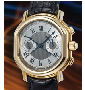
19 Daniel Roth An incredibly rare pink gold split... Estimate 30,000 — 60,000 CHF