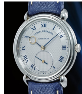
18 Urban Jürgensen An extremely well-preserved, ra... Estimate 10,000 — 20,000 CHF