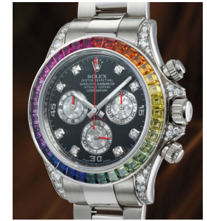
73 Rolex An extremely rare and attractiv... Estimate 180,000 — 360,000 CHF