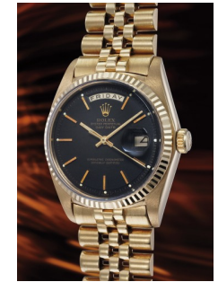
158 Rolex A rare and attractive yellow gol... Estimate 10,000 — 20,000 CHF