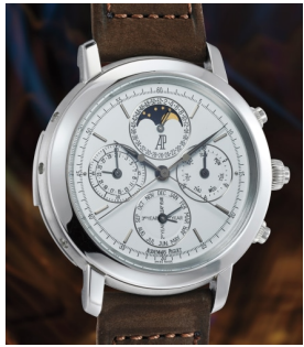
79 Audemars Piguet A rare and attractive minute rep... Estimate 70,000 — 140,000 CHF

Geneva Auction / 3 November 2023 / 2pm CET