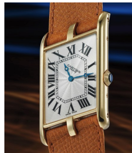
76 Cartier A highly rare, asymmetric and a... Estimate 15,000 — 30,000 CHF