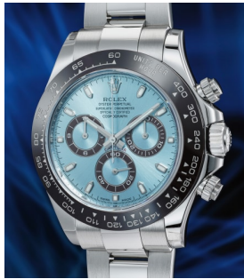
134 Rolex A very fine and rare platinum ch... Estimate 70,000 — 140,000 CHF