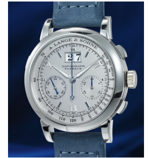
138 A. Lange & Söhne An exceptionally rare and extre... Estimate 100,000 — 200,000 CHF