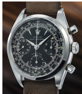
95 Rolex An extremely rare, highly attrac... Estimate 200,000 — 400,000 CHF