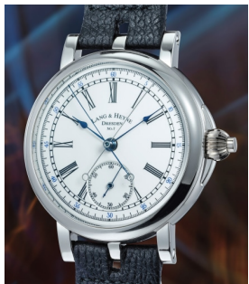
54 Lang & Heyne A sophisticated and distinguish... Estimate 18,000 — 25,000 CHF