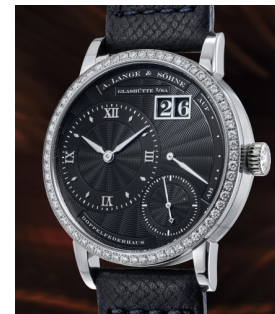
47 A. Lange & Söhne A rare and attractive limited edi... Estimate 20,000 — 40,000 CHF