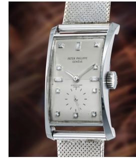
172 Patek Philippe An extremely rare, elegant and ... Estimate 40,000 — 80,000 CHF