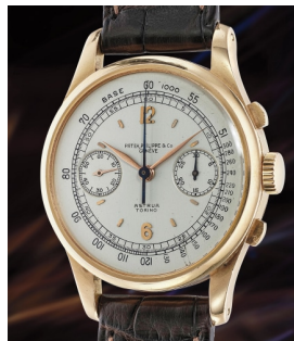
176 Patek Philippe An extremely rare, large and ver... Estimate 350,000 — 700,000 CHF