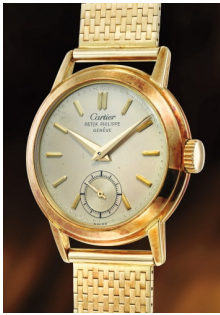
169 Patek Philippe A highly rare yellow gold wristw... Estimate 10,000 — 20,000 CHF

Geneva Auction / 3 November 2023 / 2pm CET