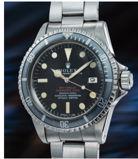
155 Rolex An early, extremely collectible a... Estimate 70,000 — 140,000 CHF