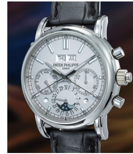
132 Patek Philippe A freshly unsealed, very fine an... Estimate 120,000 — 240,000 CHF