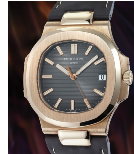
122 Patek Philippe A rare and attractive pink gold ... Estimate 35,000 — 70,000 CHF