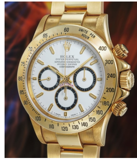
71 Rolex A rare and most probably unpoli... Estimate 30,000 — 60,000 CHF