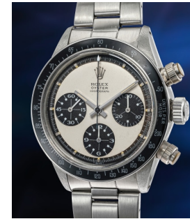
167 Rolex An attractive and extremely rar... Estimate 300,000 — 600,000 CHF