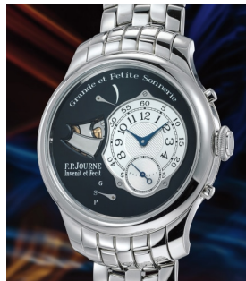
106 F.P. Journe A spectacular and ultra rare min... Estimate 500,000 — 1,000,000 CHF