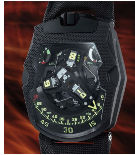
110 Urwerk A fine and attractive blackened ... Estimate 70,000 — 140,000 CHF