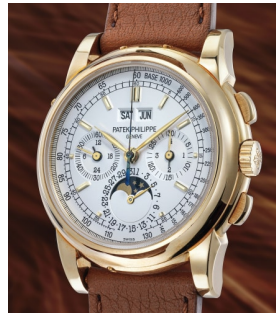
80 Patek Philippe An exquisite, very scarce and hi... Estimate 90,000 — 100,000 CHF