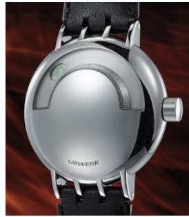
50 Urwerk An unusual and cutting edge his... Estimate 20,000 — 40,000 CHF