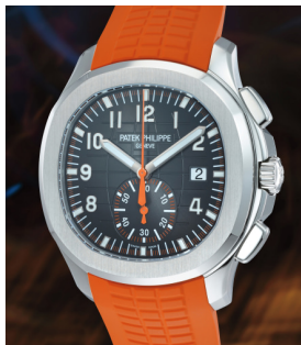
5A Patek Philippe A highly sought after and sporty... Estimate 70,000 — 140,000 CHF