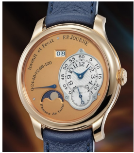
39 E.P. Journe An extremely rare and desirable... Estimate 50,000 — 100,000 CHF

Geneva Auction / 3 November 2023 / 2pm CET