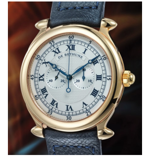
103 De Bethune An extremely fine and elegant pi... Estimate 20,000 — 40,000 CHF