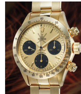
97 Rolex A spectacularly well-preserved y... Estimate Estimate On Request