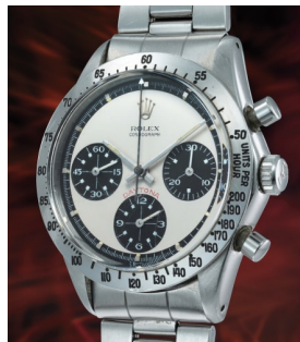
36 Rolex A highly rare and attractive stai... Estimate 120,000 — 240,000 CHF