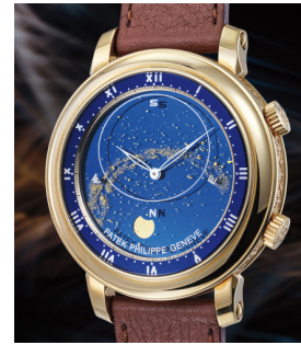
32 Patek Philippe An incredibly rare and importan... Estimate 90,000 — 100,000 CHF