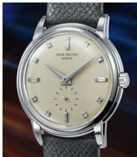
174 Patek Philippe An uber rare and well preserved ... Estimate 80,000 — 160,000 CHF