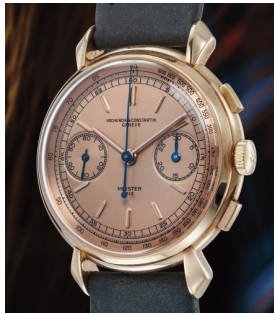
184 Vacheron Constantin An exceedingly rare, possibly un... Estimate 30,000 — 60,000 CHF