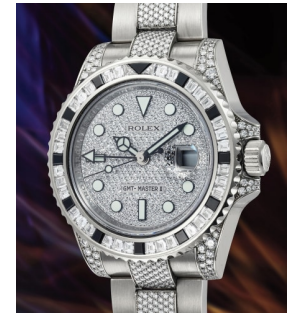
123 Rolex A bedazzling and extremely sca... Estimate 60,000 — 120,000 CHF