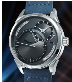
145 Grönefeld A cutting edge and innovative st... Estimate 30,000 — 60,000 CHF