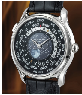
81 Patek Philippe A freshly unsealed, rare and fine... Estimate 70,000 — 140,000 CHF