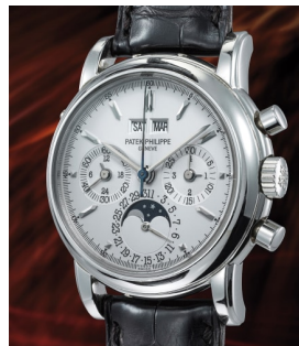
6 Patek Philippe A rare, elegant and well-preserv... Estimate 70,000 — 140,000 CHF