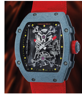
102 Richard Mille A mind boggling carbon nanotu... Estimate 400,000 — 800,000 CHF