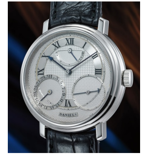
23 George Daniels A spectacular and historically i... Estimate 700,000 — 1,400,000 CHF