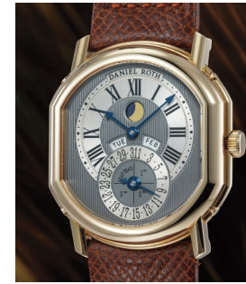
52 Daniel Roth A lovely pink gold perpetual cale... Estimate 25,000 — 50,000 CHF