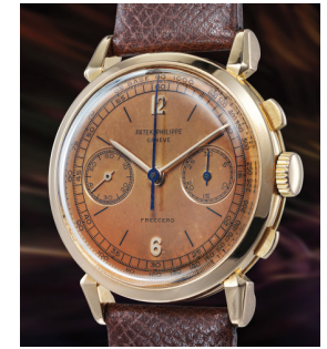
173 Patek Philippe A stunning pink gold chronogra... Estimate 100,000 — 200,000 CHF