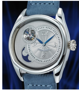
40 Andreas Strehler A unique platinum wristwatch w... Estimate 25,000 — 50,000 CHF