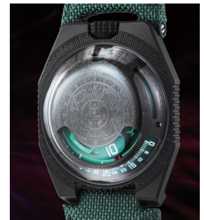
38 Urwerk A rare coated stainless steel wri... Estimate 25,000 — 50,000 CHF