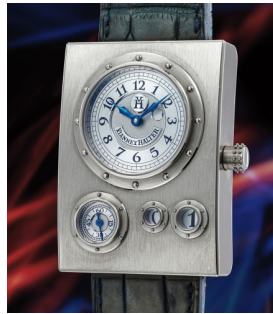
146 Vianney Halter An incredibly rare and intriguing... Estimate 50,000 — 100,000 CHF