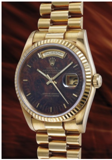
69 Rolex A rare and attractive yellow gol... Estimate 15,000 — 30,000 CHF

Geneva Auction / 3 November 2023 / 2pm CET