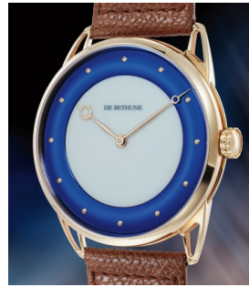
51 De Bethune An exquisite pink gold wristwatc... Estimate 30,000 — 60,000 CHF