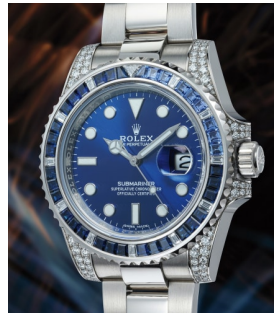
135 Rolex A highly rare, bedazzling and sp... Estimate 80,000 — 160,000 CHF