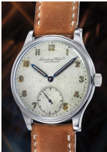
84 IWC An early, oversize and very scar... Estimate 20,000 — 40,000 CHF