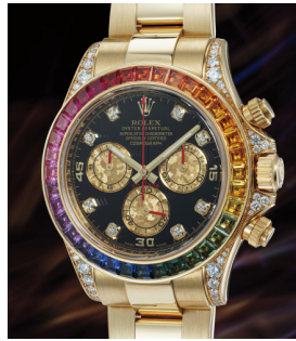
131 Rolex A very fine, attractive and rare y... Estimate 180,000 — 360,000 CHF