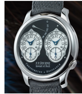
42 E.P. Journe A fine and rare limited edition pl... Estimate 150,000 — 300,000 CHF