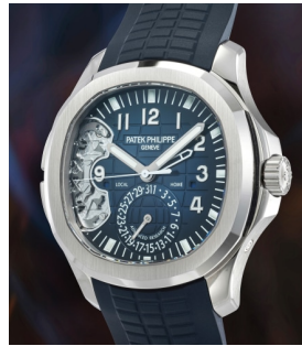
165 Patek Philippe A highly sought after and innov... Estimate 250,000 — 500,000 CHF