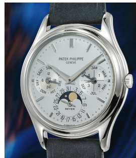
7 Patek Philippe A fine, elegant and very rare whi... Estimate 50,000 — 100,000 CHF