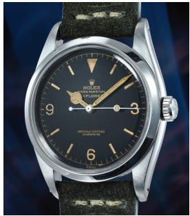
154 Rolex A charming and very well preser... Estimate 18,000 — 36,000 CHF