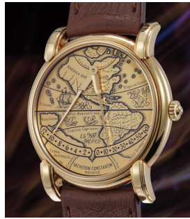
141 Vacheron Constantin An avant garde and ingenious y... Estimate 15,000 — 30,000 CHF