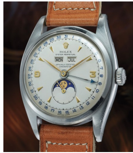
12 Rolex An incredibly rare and exception... Estimate 1,000,000 — 2,000,000 CHF