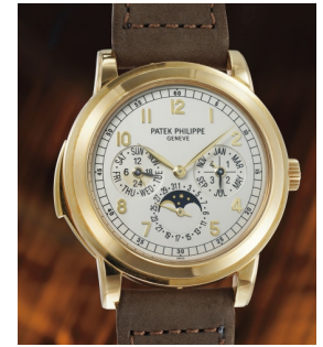
163 Patek Philippe An exquisite, stately and highly ... Estimate 250,000 — 400,000 CHF