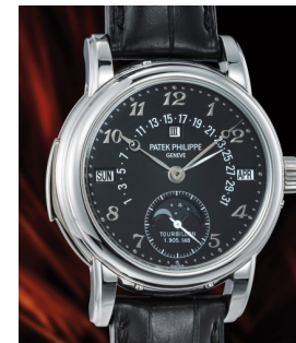
8 Patek Philippe A technically superlative, extre... Estimate 300,000 — 600,000 CHF