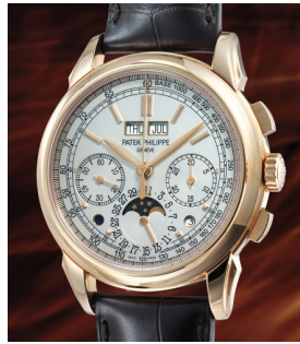
31 Patek Philippe A highly rare and attractive pink... Estimate 70,000 — 100,000 CHF