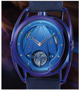
20 De Bethune A surprising and cutting edge bl... Estimate 55,000 — 100,000 CHF

Geneva Auction / 3 November 2023 / 2pm CET