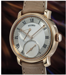
149 Roger Smith An exceptionally rare and impor... Estimate 250,000 — 500,000 CHF

Geneva Auction / 3 November 2023 / 2pm CET