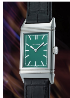
25 Jaeger-LeCoultre An extremely attractive limited ... Estimate 10,000 — 20,000 CHF