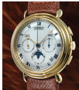
105 Urban Jürgensen A pioneering, bold, and ingenio... Estimate 20,000 — 40,000 CHF