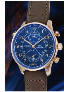
112 IWC A highly rare and attractive pink... Estimate 15,000 — 25,000 CHF