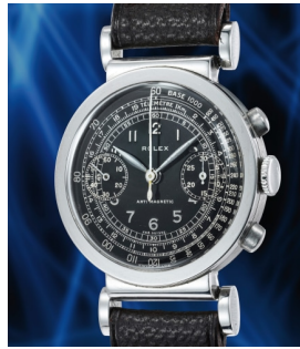
171 Rolex A very fine, elegant and rare sta... Estimate 25,000 — 50,000 CHF