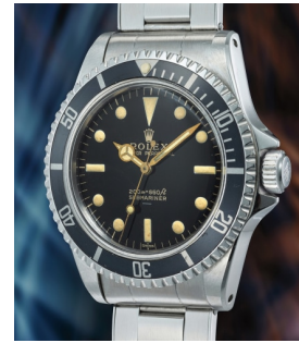
13 Rolex A highly rare and extremely attr... Estimate 35,000 — 50,000 CHF