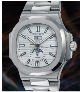
101 Patek Philippe A highly rare stainless steel ann... Estimate 70,000 — 140,000 CHF