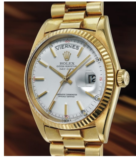
130 Rolex A fine and attractive yellow gold... Estimate 15,000 — 30,000 CHF